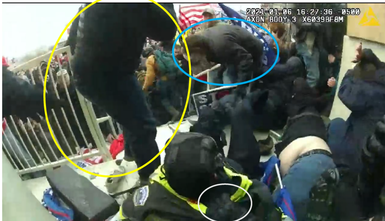
GX 304 at 07:09