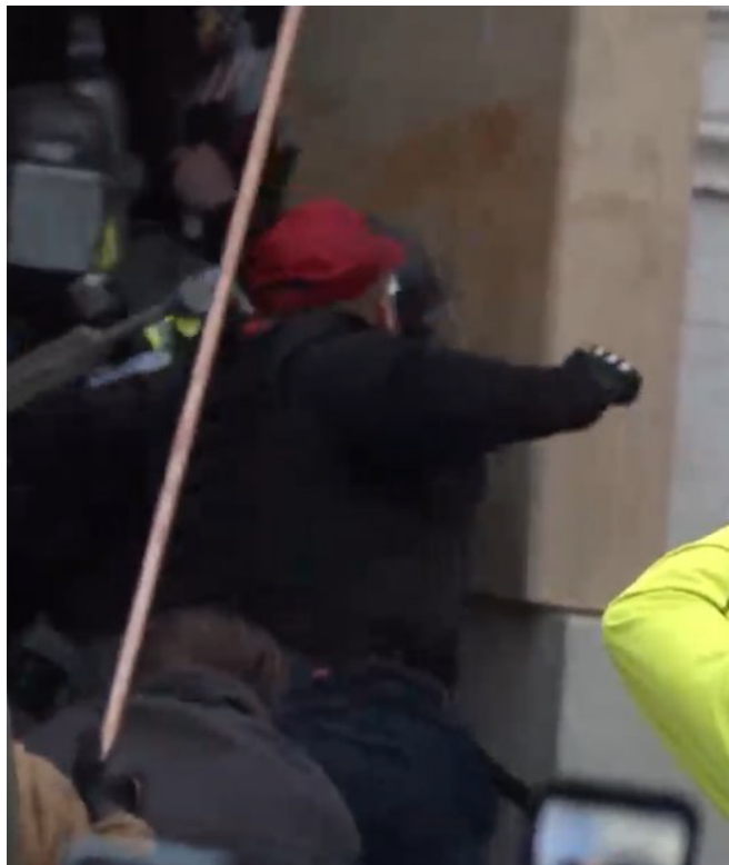
GX 303 at 07:22