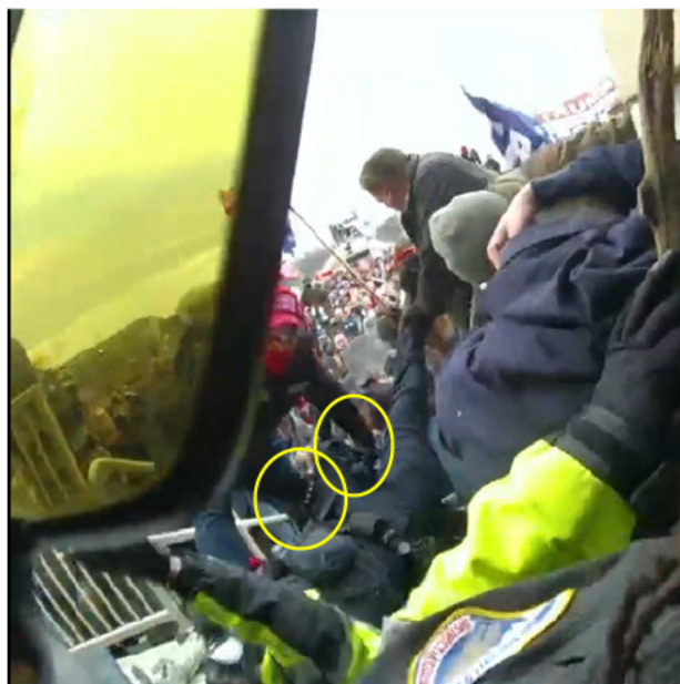
GX 305 at 04:46

McAbee (hands circled in yellow) grabs Officer Wayte's leg and pulls him away from the police line