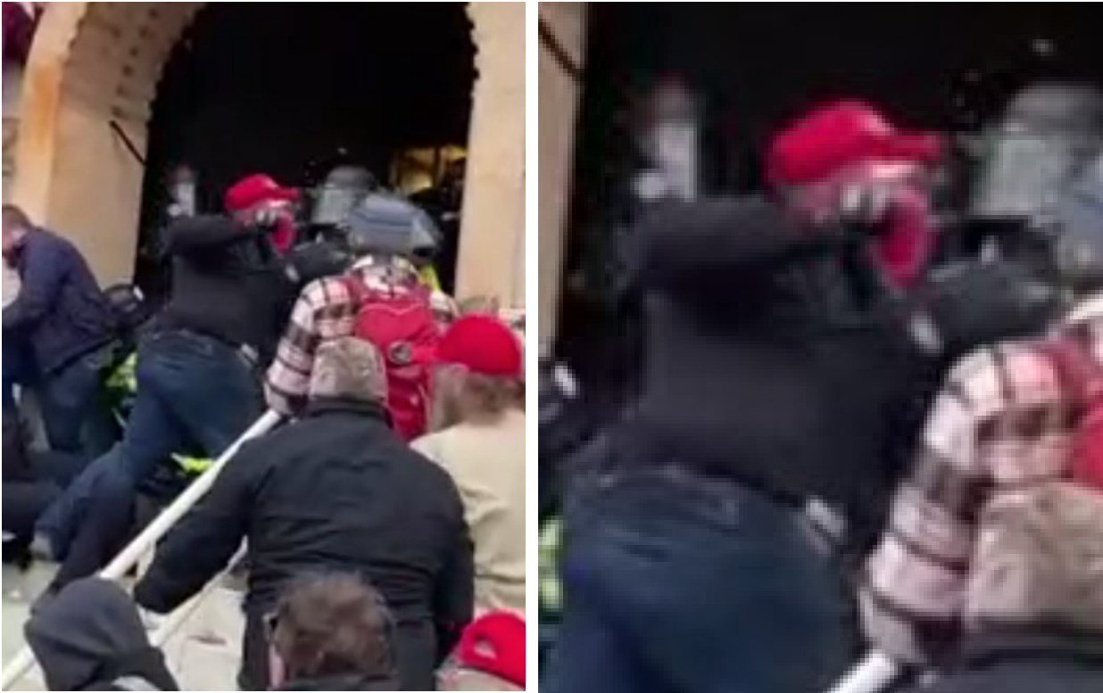
GX 414 at 01:48