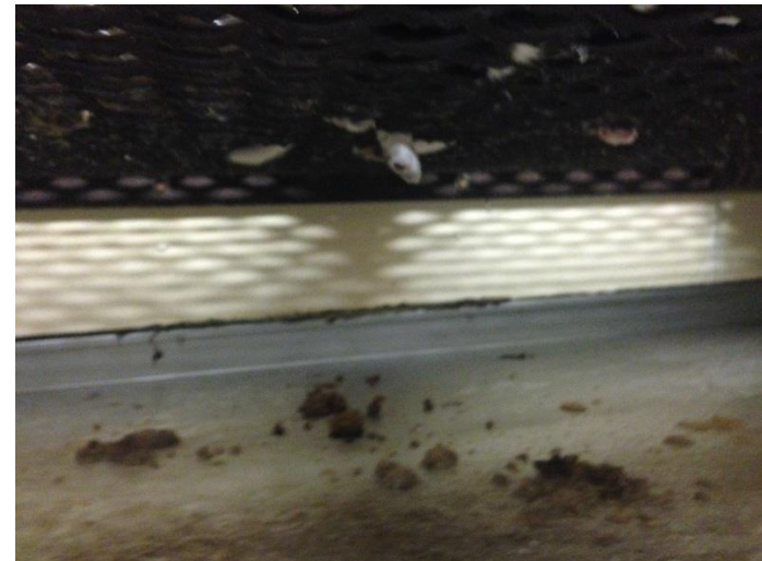
Pictures 3-4: Note white feet and legs of puppies passing through floor openings (view from below flooring). Pictures taken from two separate enclosures.