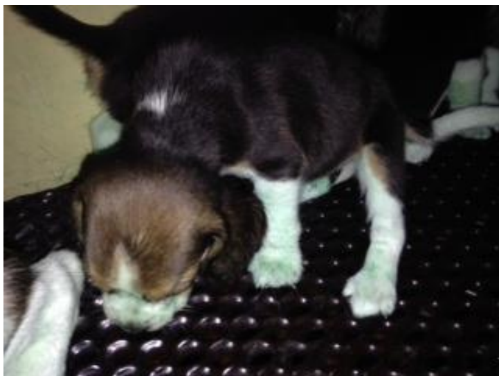
Picture 1: Smaller openings Picture 2: Puppies on new flooring.