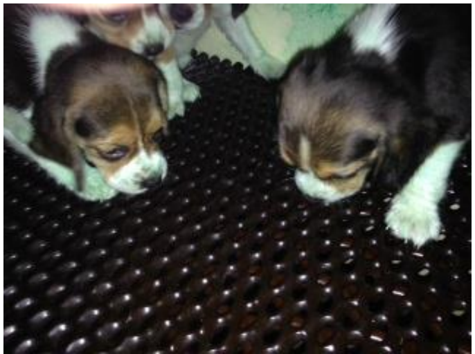
Pictures 3-4: Puppies on flooring with smaller openings. Note size of paws relative to size of gaps.