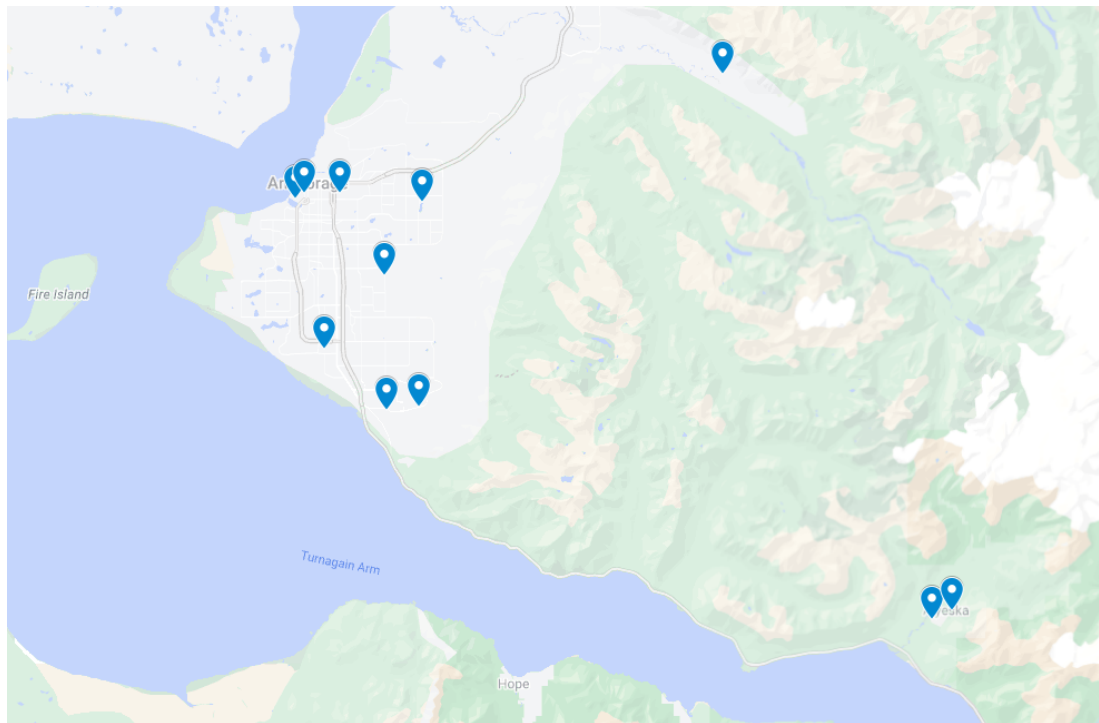
Figure 1. New ADU Permits since May 2023. Addresses not shown for privacy.

Prior to AO 2022-107 (AA), all property owners with ADUs were required to file an affidavit of owner occupancy with the Planning Department. Up until the reform, these records provided the most consistent data for ADU production in the Municipality. After AO 2022-107 (AA) removed the owner occupancy requirement, the Planning Department no longer had an accurate way to track ADUs, and thus worked with other departments to add a checkbox to new building permits to indicate when new construction includes an ADU. This section was fully integrated into building permits in May of 2023. Since then, the MOA has recorded 11 permits for new ADUs throughout the year.