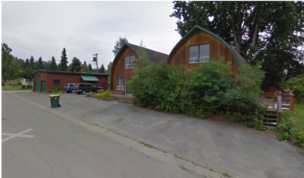
Figure 2: A 7,000 square-foot R-2M lot that was unable to convert the garage into an ADU without triggering triplex regulations because there is no definition of a "detached two-family" in Title 21. Shown with permission of the property owner.

1 2 3 4 5 6 7 8 9 10 11 12 13 14 15 16 17 18 19 20 21 22 23 24 25 26 27 28 29 30 31 32 33 34 35