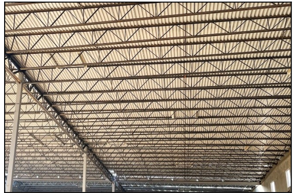
Open web steel truss