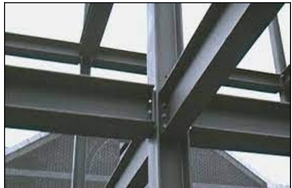
Structural steel framing