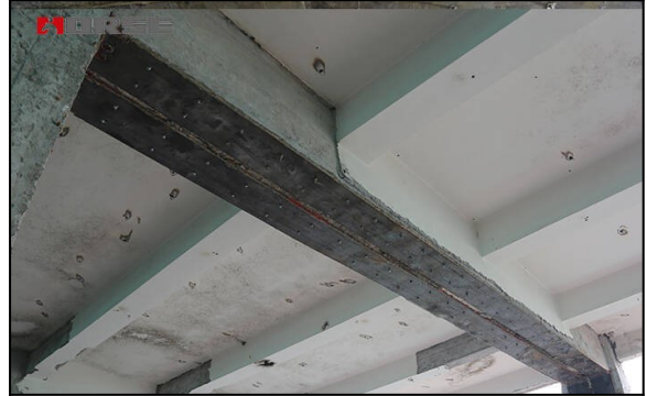
Solid concrete construction