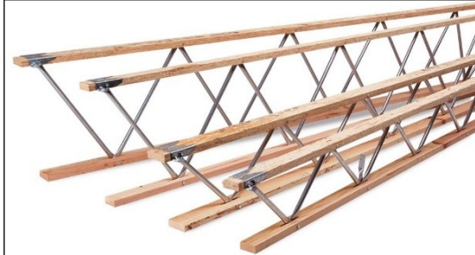
Open web wood truss