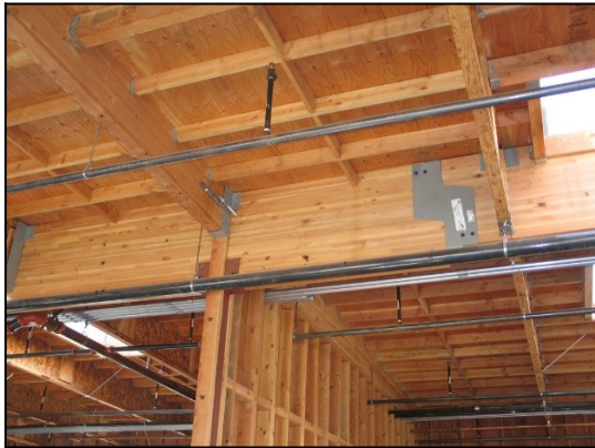
Solid sawn or glulam construction