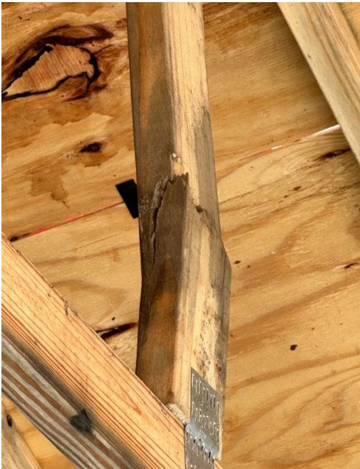
Item C: Web chord broken (likely during construction).