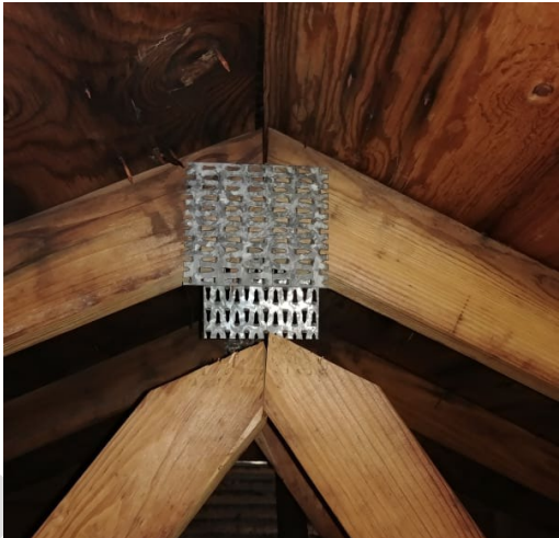
Item B: Fully detached plates.