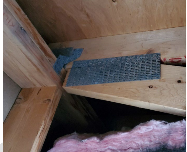
Item F: Truss plate not extending high enough at bearing location (beyond middle depth of the top chord at a minimum)