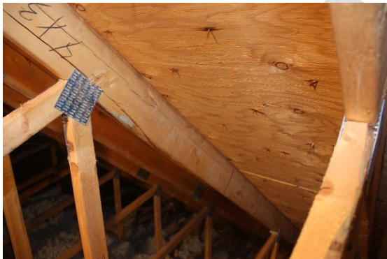
Item G: Example of short truss plate causing cross grain tension failure of truss top chord.