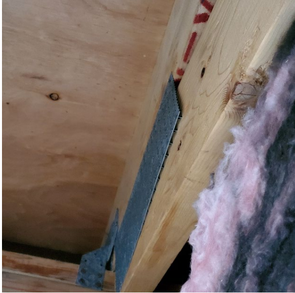
Item E: Truss plate peeling (maximum gap of plate allowed = 1/32", TPI 1-2014).