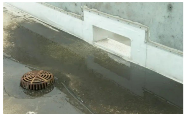
Item J: Primary roof drain next to secondary roof scupper. It is not required that they be next to each other.