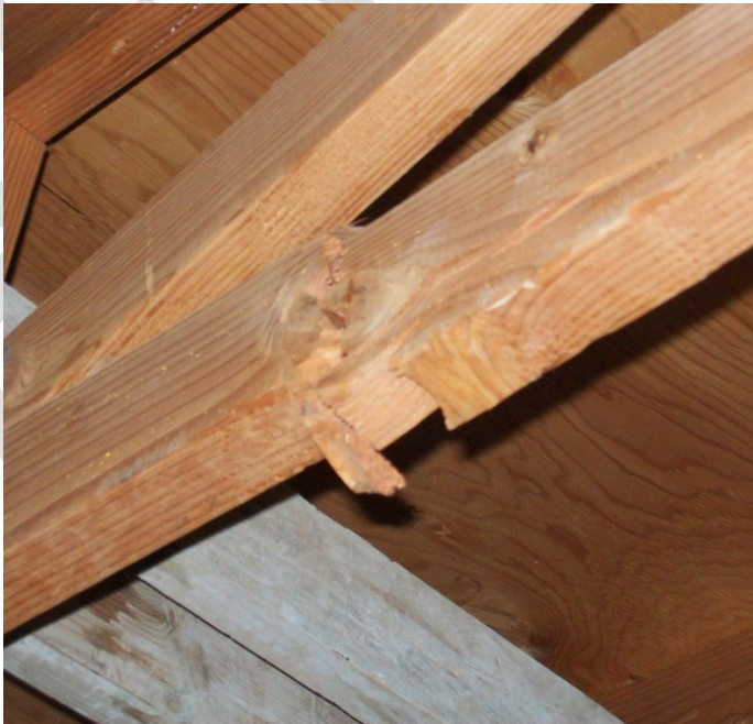
Item D: Bottom chord failure at large knot.