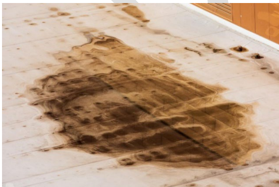
Item I: Evidence of ponding, dark stains from standing water away from drainage systems.