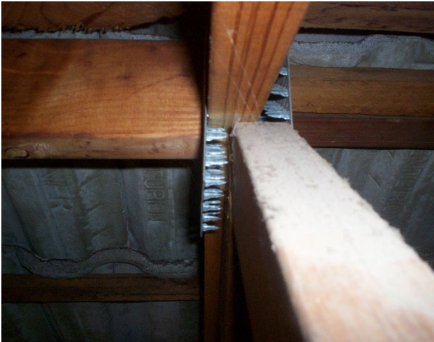
Item A: Incomplete plate connection.