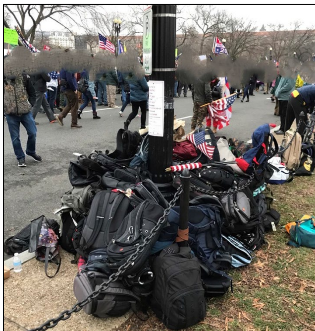
Figure 4: Abandoned Bags on Constitution Avenue Outside of the Ellipse on January 6, 2021

This photo was modified by the OIG to obscure features.