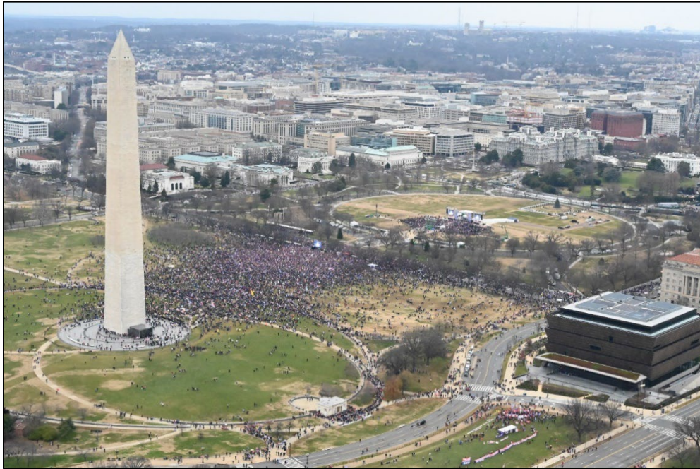
Figure 5: Photo of the Washington Monument and the Ellipse at 10:36 a.m. on January 6, 2021