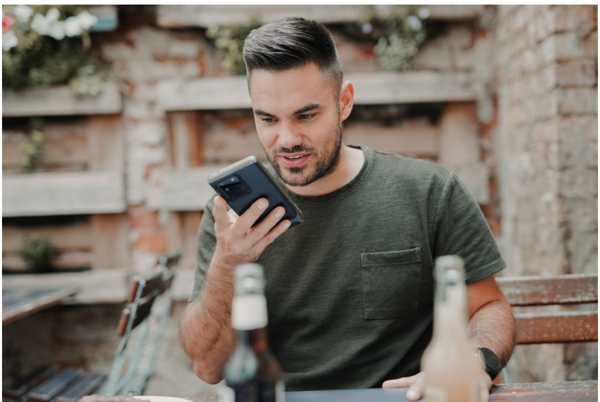
Creepy? Sure. Great for marketing? Definitely.

That means a smart device is likely within earshot when we talk about our plans for the weekend, how badly we need our kitchen remodeled, or debate which SUV model is best for the family with our spouse, and so much more.