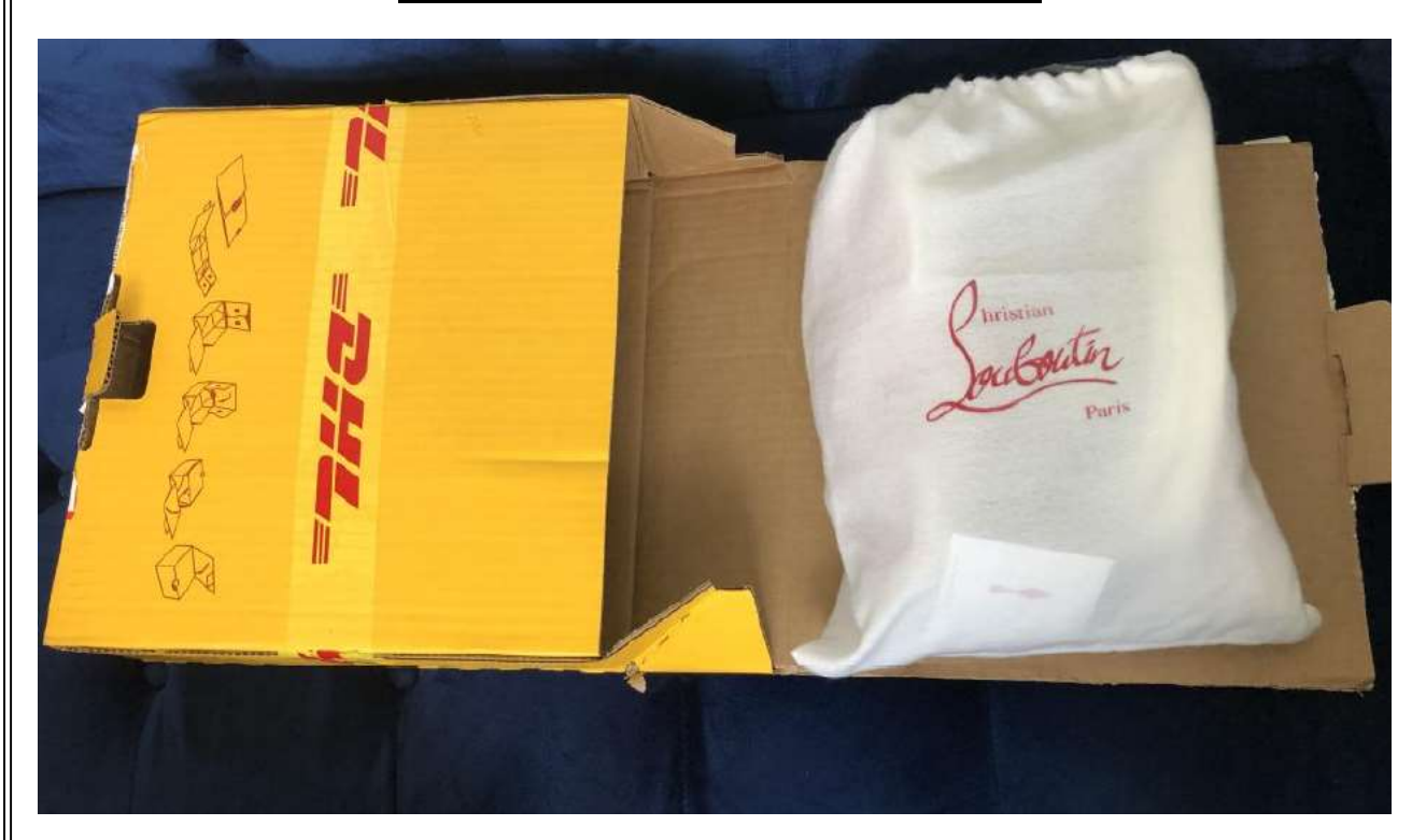
Figure 3: Defendant's Counterfeit Sneakers