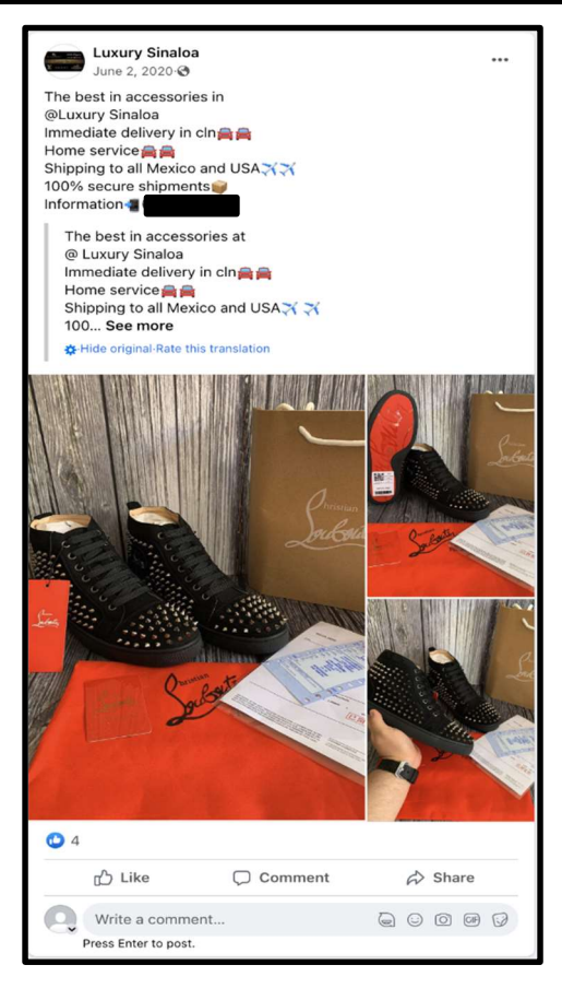
Figure 1: Defendant's Counterfeit Louboutin Sneakers

46. On February 11, 2018, Defendant created an Instagram account with the username "shopcg_cln." Figure 2 is a screenshot of a January 30, 2023 post including contact information for Defendant and three Louboutin-branded sneakers. On November 16, 2023, Meta disabled the "shopcg_cln" account for violating Instagram's Terms against violating third parties' intellectual property rights.