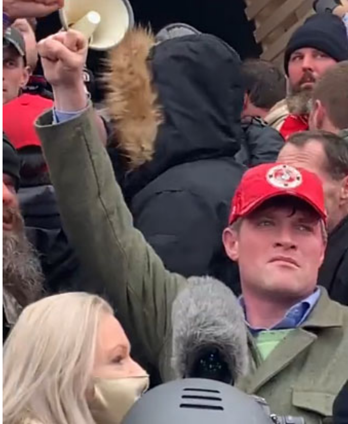
Image 7: Still Image from Government Trial Exhibit 535 at Timestamp 00:38

Despite Klein's and other rioters' considerable and coordinated efforts, the police line at the tunnel did not fail.