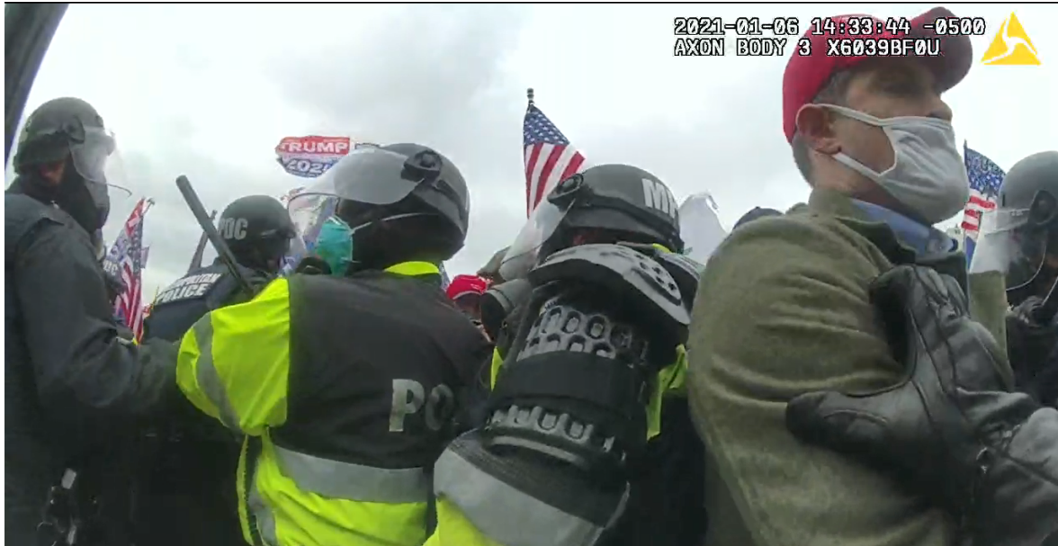
Image 1: Still Image from Government Trial Exhibit 410 Showing Klein Pushing Officers

turned around to other rioters and called out, “We need some more, let’s go!”