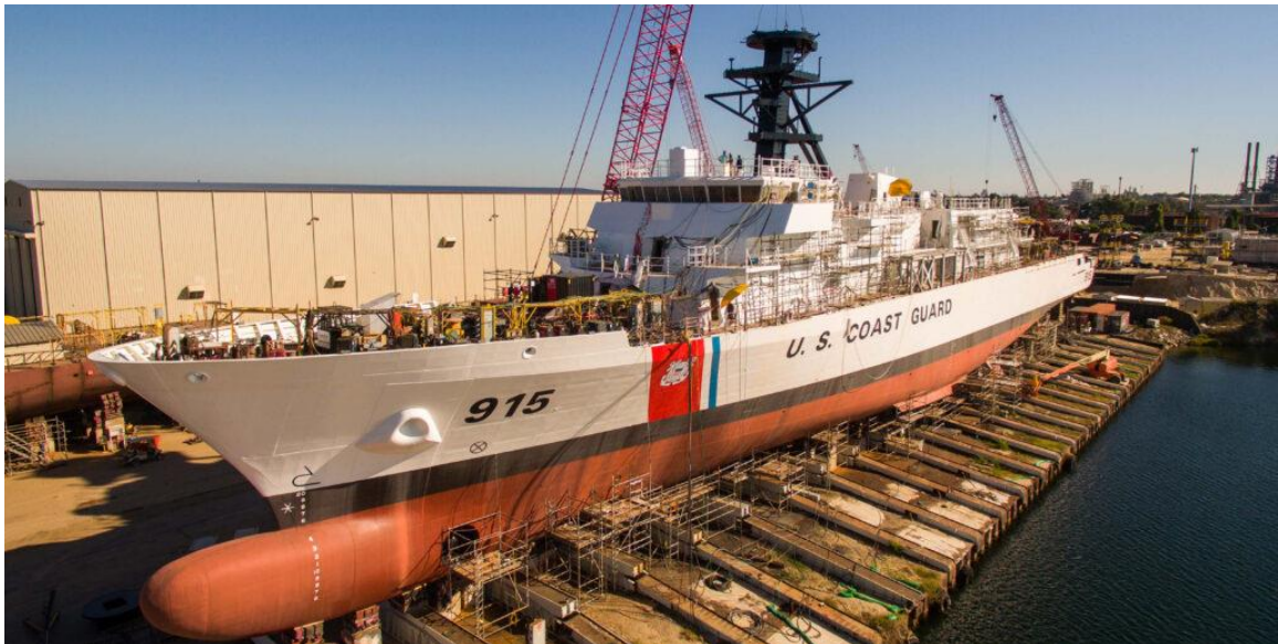
Figure 8. First Offshore Patrol Cutter Under Construction