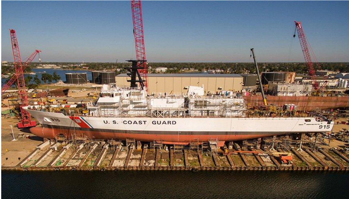
Figure 7. First Offshore Patrol Cutter Under Construction