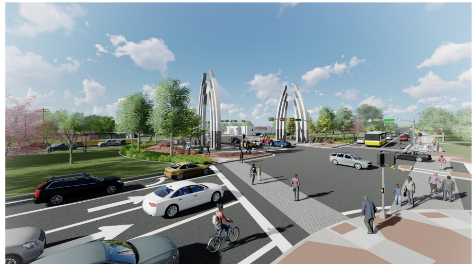
PINE STREET & S.M. WRIGHT | SOUTH EAST CORNER LOOKING WEST