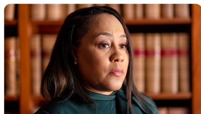
Exclusive: Georgia prosecutors have messages showing Trump's team is behind voting system breach | CNN Politics cnn.com