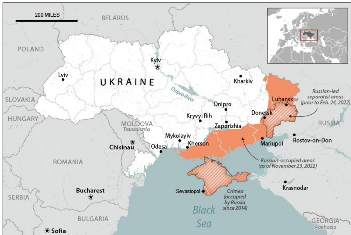
Figure 4. Ukraine Territorial Control, Winter 2022-2023

Source: Created by Congressional Research Service using data from U.S. Department of State, Global Admin, and ESRI.