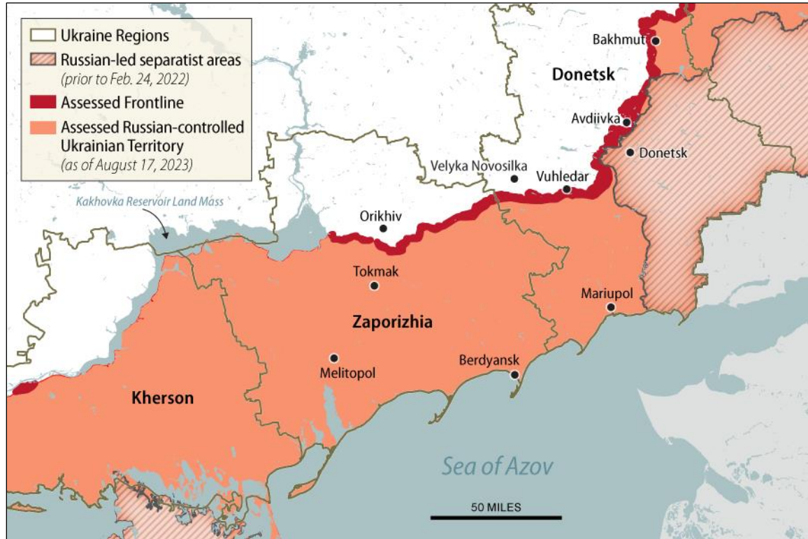
Figure 6. Southern Ukraine Territorial Control As of August 17, 2023

Source: Created by CRS using data from U.S. Department of State, Global Admin, and ESRI. Lines of territorial control are approximate using data from the Institute for the Study of War.