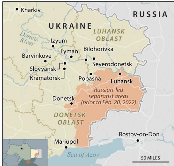
Figure 2. Donbas Region of Ukraine