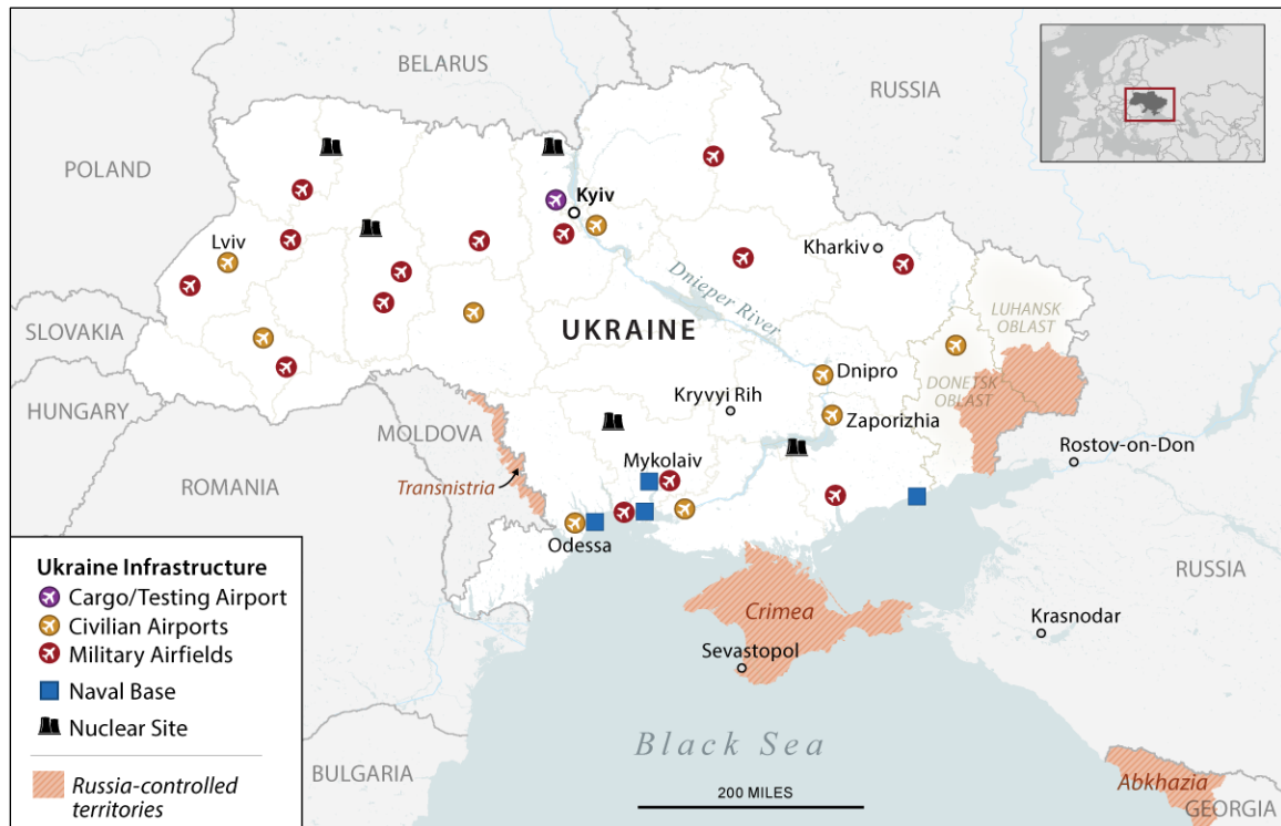
Figure 3. Ukraine Airfields and Key Infrastructure