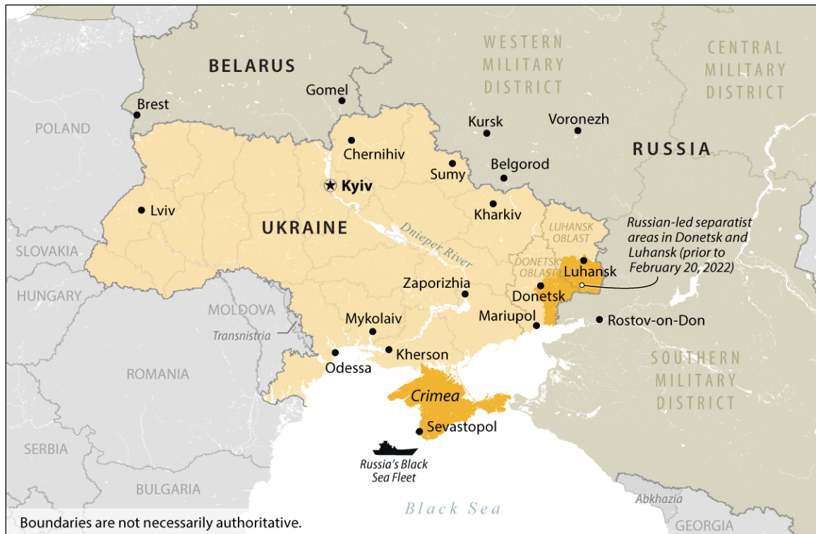
Figure I. Ukraine