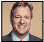
Rodger Goodell, NFL Commissioner