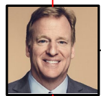
Rodger Goodell, NFL Commissioner