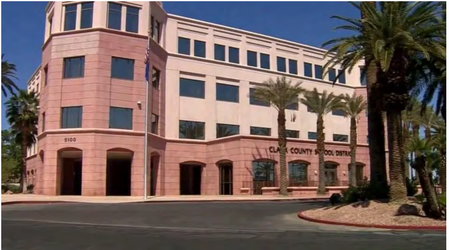
The Clark County School District headquarters on Sahara Avenue