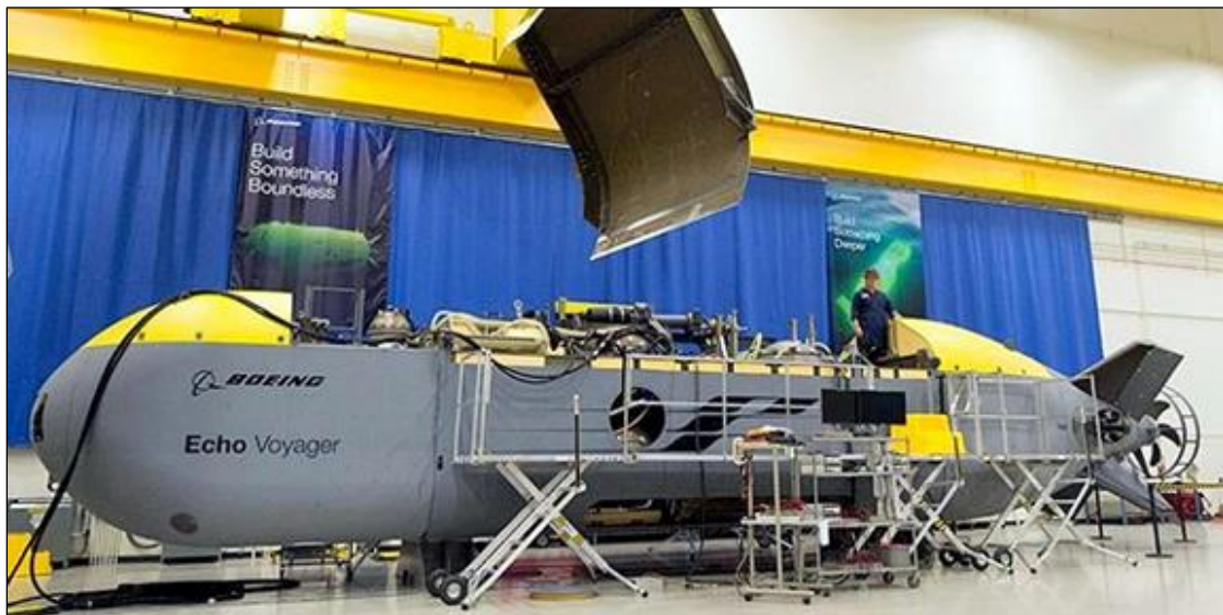
Figure 8. Boeing Echo Voyager UUV