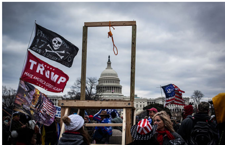
Trump's mob displays a noose and gallows on the Capitol grounds

381. The mob assembled gallows on the Capitol grounds as an intimidatory display. Later, as they stormed the Capitol building, they chanted, “Hang Mike Pence!”