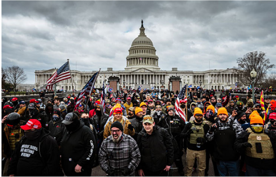
Proud Boys gather on the Capitol's East Front