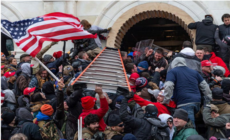
Trump's mob assaults police officers outside of the Capitol's West Terrace tunnel