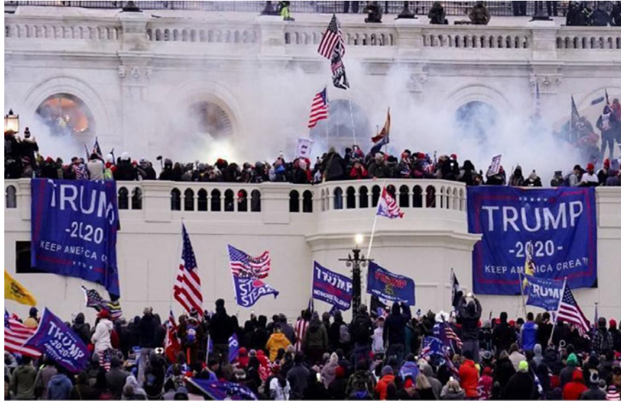
Trump’s mob attacks the Capitol