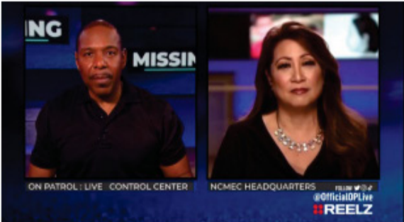
On Patrol: Live