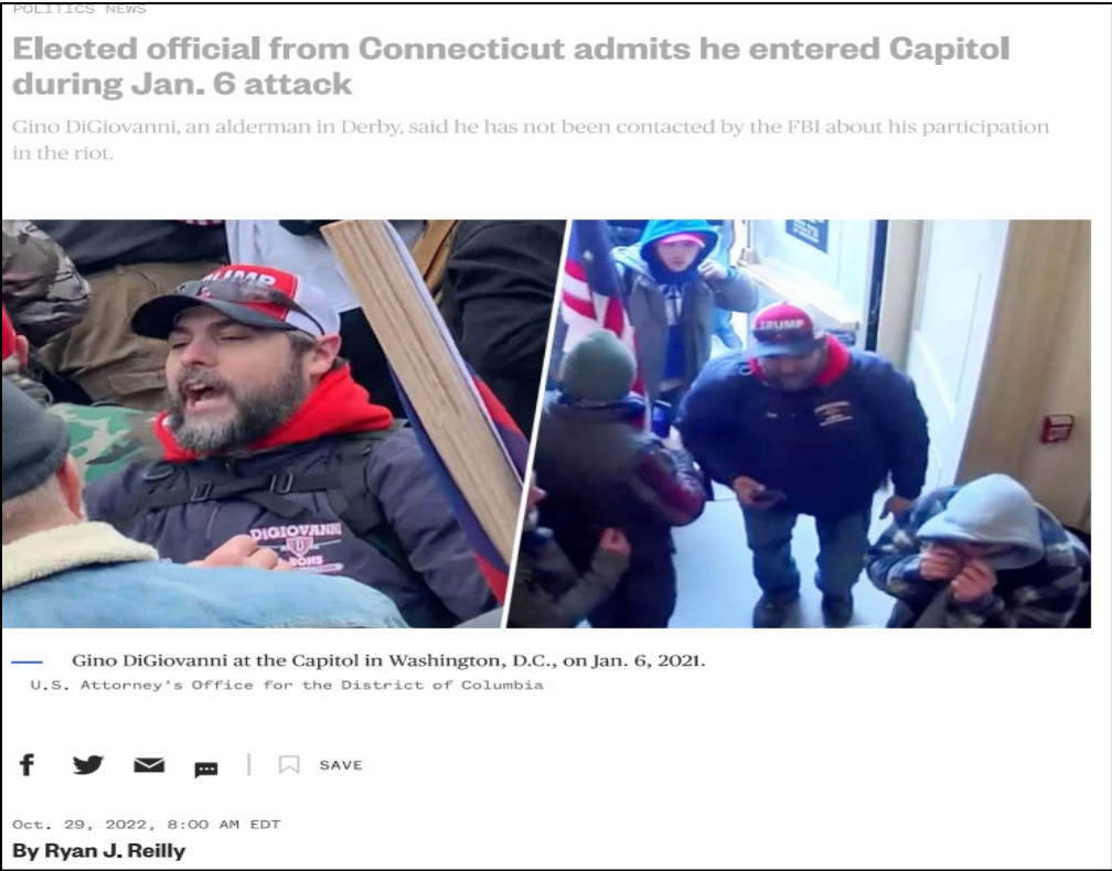
Image 2: Additional reporting regarding DIGIOVANNI'S on-camera admissions