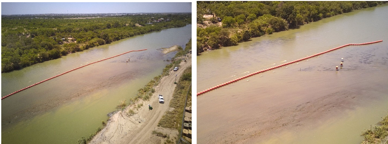
Fig. 3 – Garcia Decl. Ex. 2, full view and closeup of Floating Barrier on July 17

Texas's construction of the Floating Barrier has already substantially harmed the United States' foreign relations with Mexico. Quam Decl. ¶¶ 3, 13. On numerous occasions since late June, the Government of Mexico has lodged protests with the United States, including at the highest diplomatic levels, regarding Texas's deployment of the Floating Barrier. Id. ¶¶ 8, 11. Mexico has asserted that the Floating Barrier violates various international treaties. Id. ¶ 9.