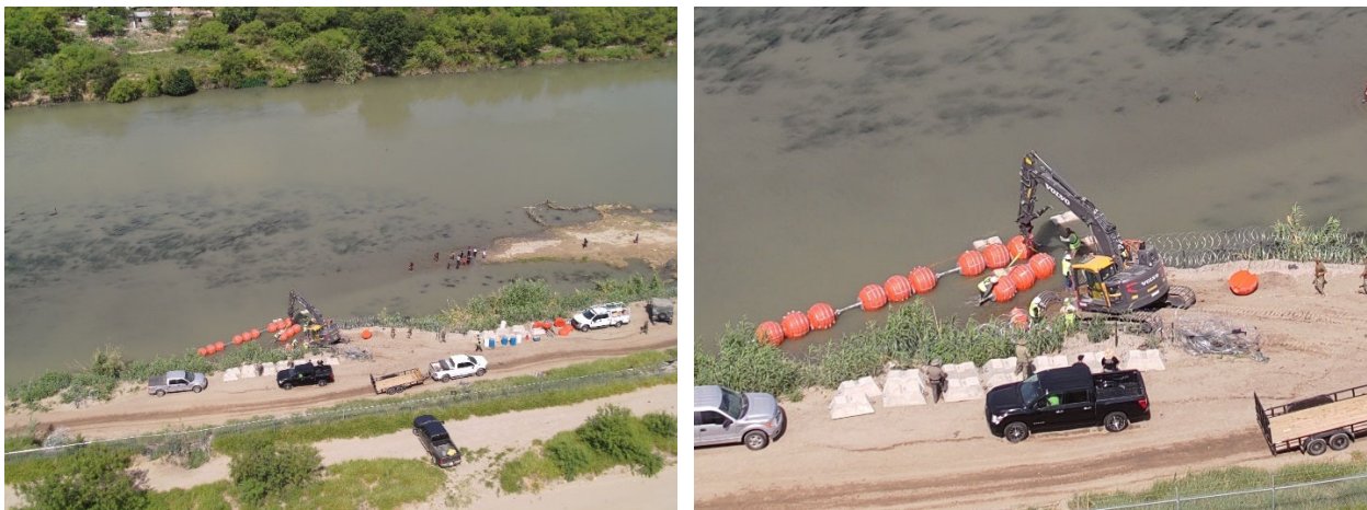
Fig. 1 – Garcia Decl. Ex. 1, full view and closeup of Floating Barrier components on July 10

On or before July 10, Texas began building a floating barrier system in the Rio Grande roughly two miles downstream of the International Bridge II in Eagle Pass (the “Floating Barrier”). See Garcia Decl. Ex. 1; Shelnett Decl. ¶ 5; Gomez Decl. ¶ 4. Texas never sought authorization from the Corps or any federal agency to erect the Floating Barrier, and the Corps has not issued a Section 10 permit for it. Shelnett Decl. ¶ 14. Photos of Texas’s building activities from July 10 show excavators lifting buoy segments and placing them in the river. Garcia Decl. Ex. 1. The buoy segments appear to be anchored in the Rio Grande by large concrete blocks, with additional concrete blocks staged along the bank. Id.