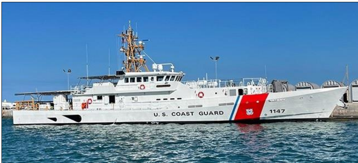
Figure 9. Fast Response Cutter