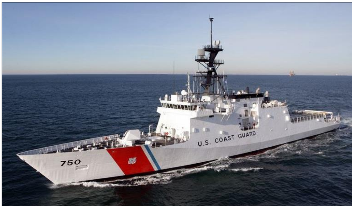
Figure 2. National Security Cutter

The caption to the photograph states that it was taken on December 4, 2007.