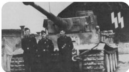
Tiger li Mg 34 German Soldiers V >