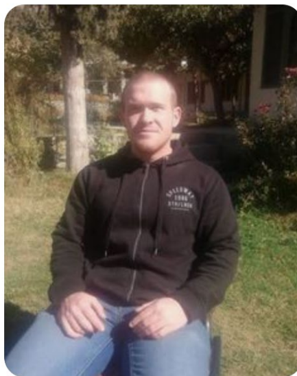
Cute People Men Christchurch >