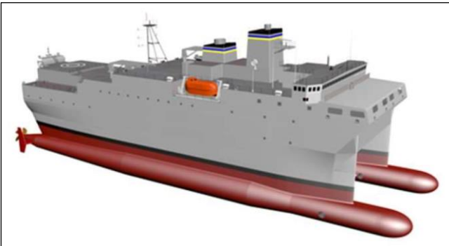
Figure 4. Notional Navy Design for TAGOS-25

Source: Artist’s rendering accompanying press released entitled “Halter Marine Secures Contract for Industrial Studies for T-AGOS Program,” Halter Marine, July 20, 2020.