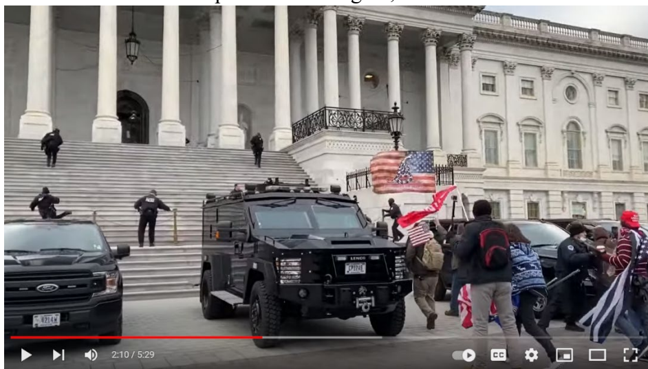
Patriots Storm U.S. Capitol in Washington, D.C.