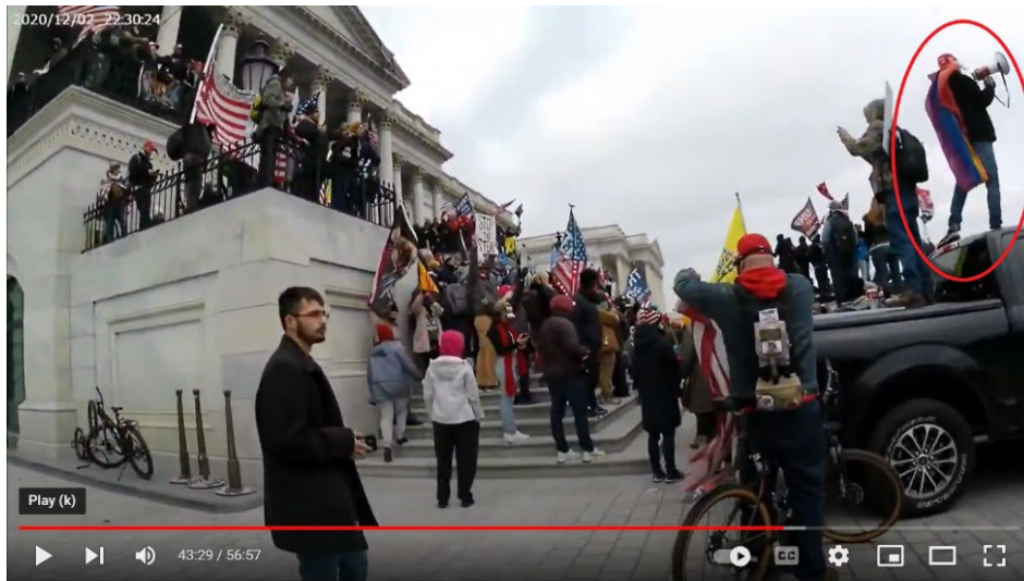
A Very Exciting Hour

A review of the “REEL: The Capitol Siege – January 6th – RAW FOOTAGE” YouTube video reveals CHRISTIE in possession of a claw hammer tucked into the belt loop of his pants. In the following two photos, the handle and claw of the hammer are visible as CHRISTIE extends his arms and torso upward.