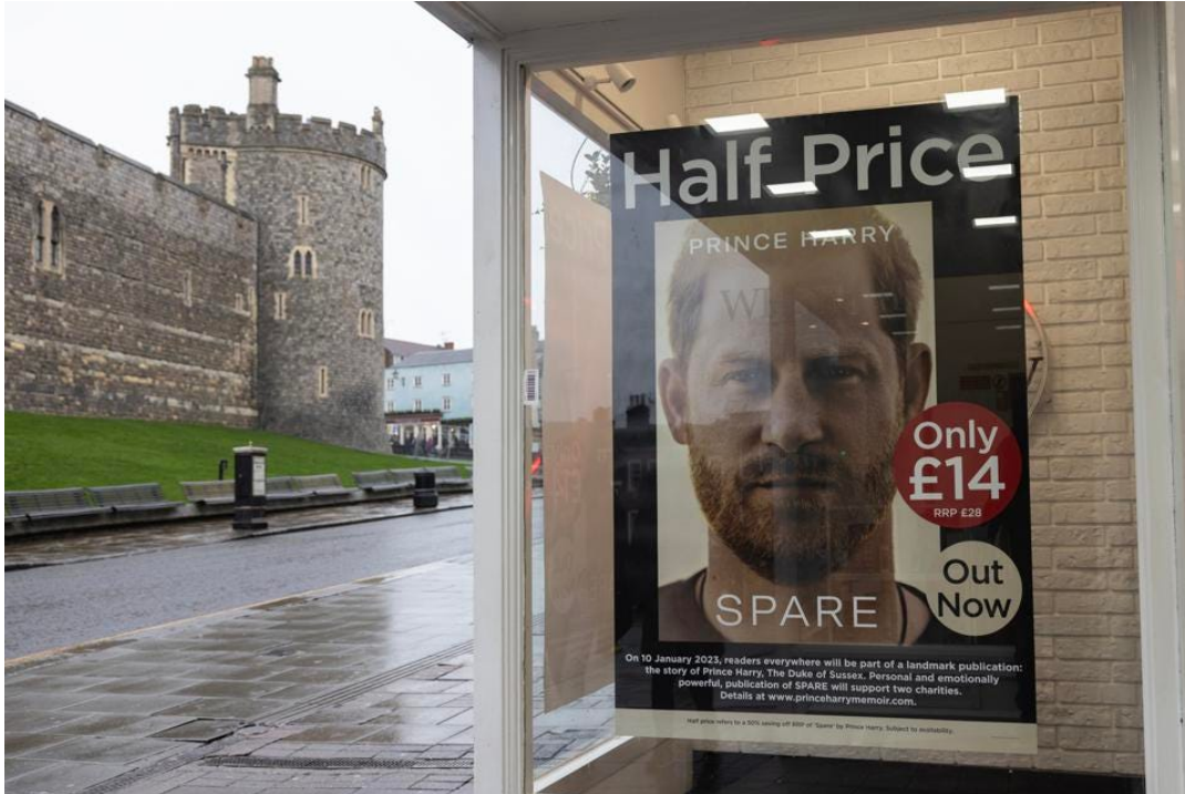
Prince Harry's memoir, 'Spare,' goes on display in a branch of WHSmith opposite Windsor Castle on...

Forbes Daily: Our best stories, exclusive reporting and Forbes perspectives on the day's top news, plus the inside scoop on the world's most important entrepreneurs.