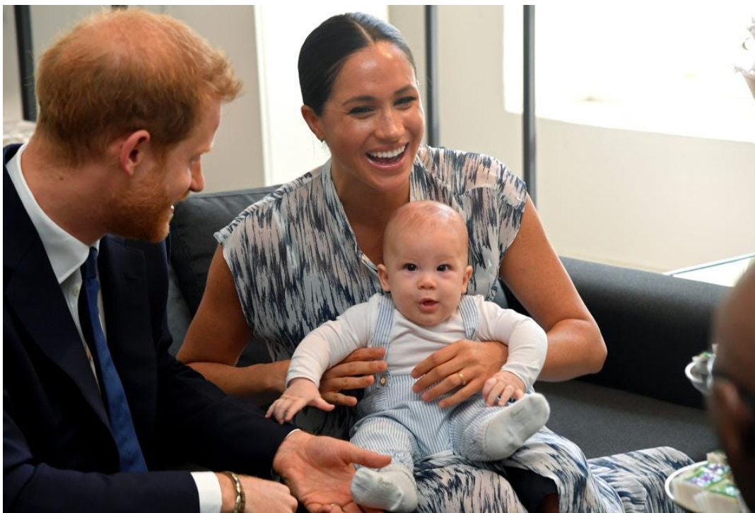
Harry, Meghan and their baby son, Archie, meet Archbishop Desmond Tutu at the Desmond & Leah Tutu... [+]