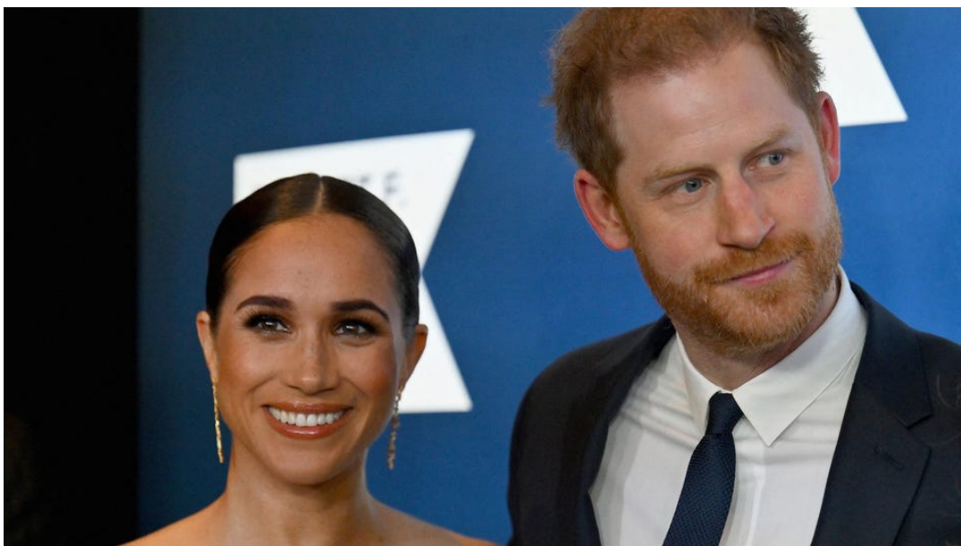
Prince Harry, Duke of Sussex, and Meghan, Duchess of Sussex, arrive at the 2022 Robert F. Kennedy... [+]