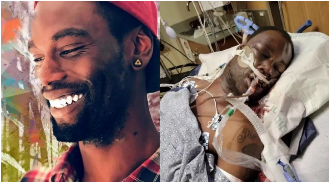
The picture on the left shows Tyre Nichols in 2021.

This lawsuit is a civil indictment under the laws of the United States against the City of Memphis, its Police Department, its Chief of Police, the SCORPION Officers involved, and all those complicit in the deprivation of Tyre Nichol's constitutional rights, his pain and suffering in his last days on this Earth, and his wrongful death on January 10, 2023.