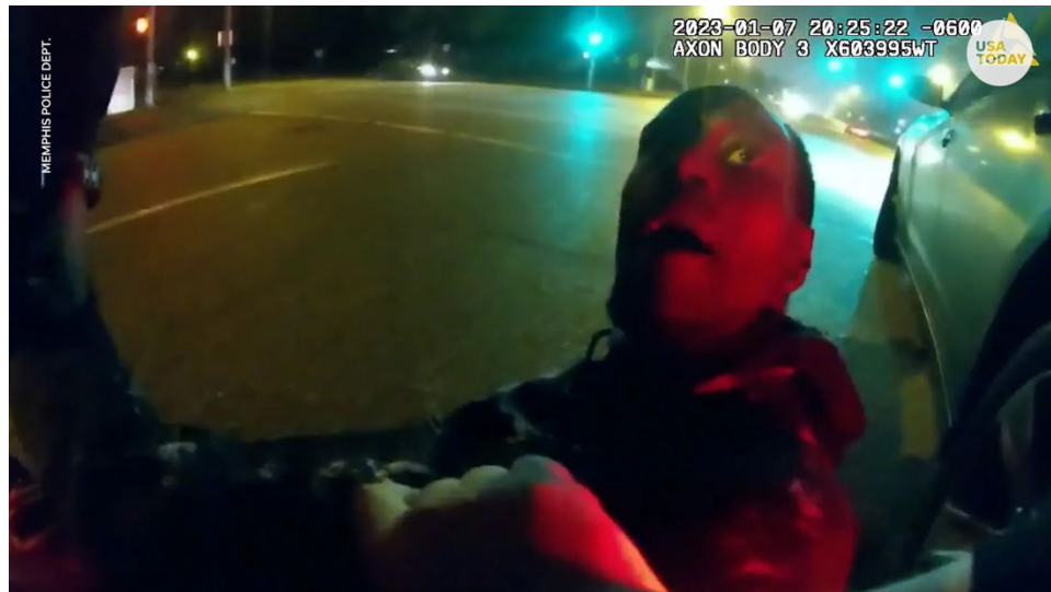
Tyre looking up at Officers terrified and confused as to why he was pulled from the car.