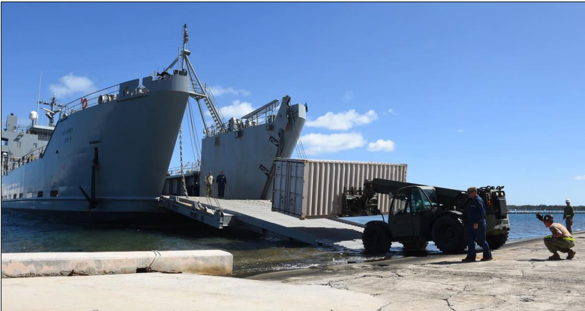
Figure 4. Besson-Class Logistics Support Vessel (LSV)