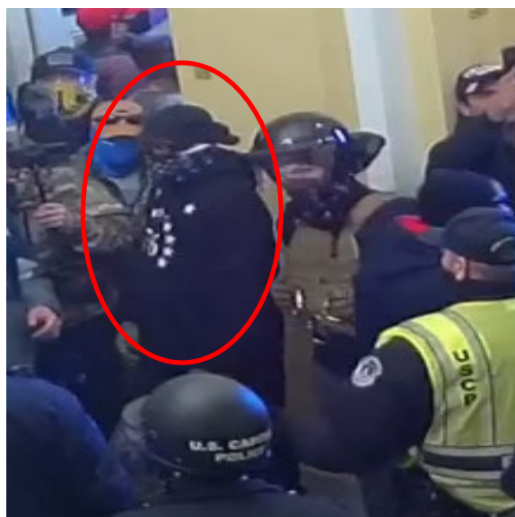
Figure 6: screenshot from USCP CCTV surveillance camera

As seen in the above screen shots from CCTV footage, an individual I believe to be Pelham based on his appearance, clothing, and the times and locations he was observed, was seen inside