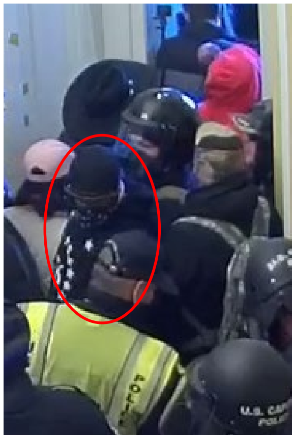
Figure 5: screenshot from USCP CCTV surveillance camera