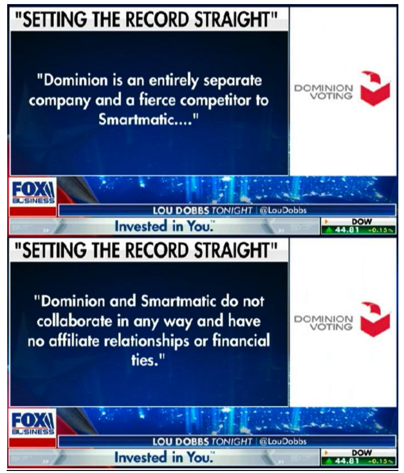
(Portions of Dominion's "Setting the record straight" emails were shown during the segment.)

fierce competitor to Smartmatic," end quote. "Dominion and Smartmatic do not collaborate in any way and have no affiliate relationship or financial ties."