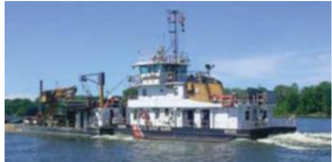
Figure 1. Coast Guard River Buoy Tender (WLR)

As of 2019, the 13 WLICs were based at cities along the U.S. East and Gulf coasts in Alabama, Florida (three cutters), Louisiana (two cutters), Maryland, North Carolina, South Carolina, Texas (three cutters), and Virginia. As of 2019, the four WLIs were based at locations in Alaska, Michigan, Oregon, and North Carolina.