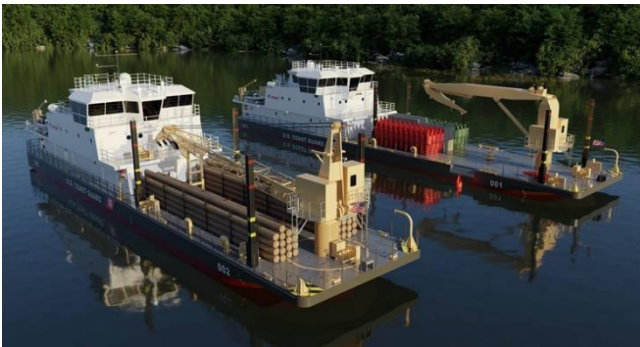
Figure 2. Notional Rendering of WLIC and WLR