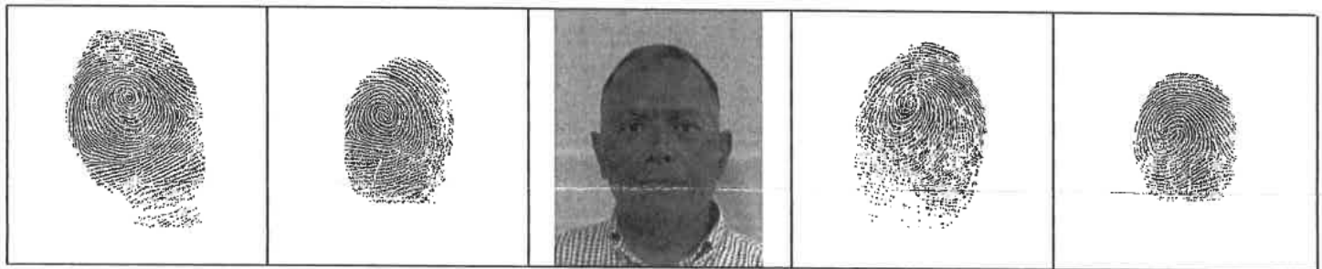
Right Thumb Pouce droit

Date Fingerprint Search Completed / Date de la recherche d'empreintes dactyloscopiques : 2019-04-11