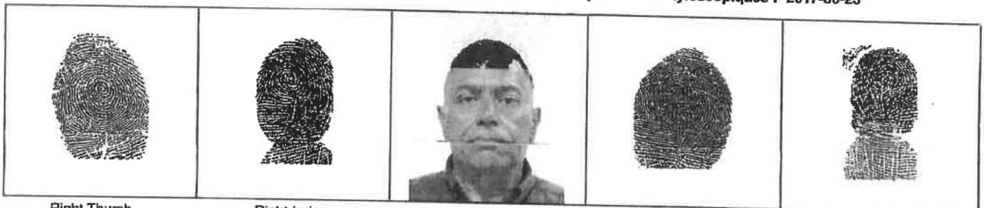
Right Thumb Pouce droit

Date Fingerprint Search Completed / Date de la recherche d'empreintes dactyloscopiques : 2017-06-23