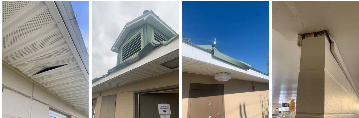
Figure 2. Images of structural damages sustained at facilities that housed Afghan Refugees at Camp Atterbury, Indiana

Camp Atterbury received approval for $16 million in OHDACA funds to replace mattresses and furniture and repair floors, doors, windows, plumbing, fire alarm systems, and landscaping. Figure 2 shows some of the damages to Camp Atterbury facilities.