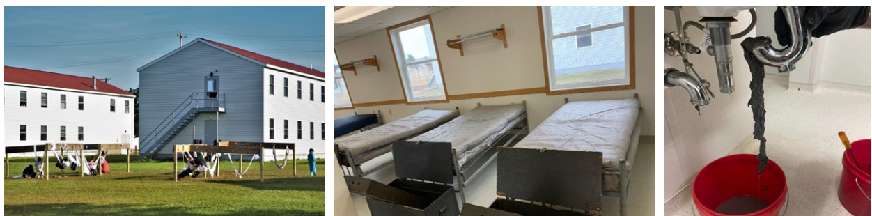
Figure 3. Fort McCoy Barracks used during OAW and a clogged pipe

Fort McCoy's barracks used during OAW were built in the 1940s, during World War II. Figure 3 is an example of the barracks that housed Afghan evacuees during OAW and an example of the plumbing issues that were commonly found after the conclusion of the OAW mission.