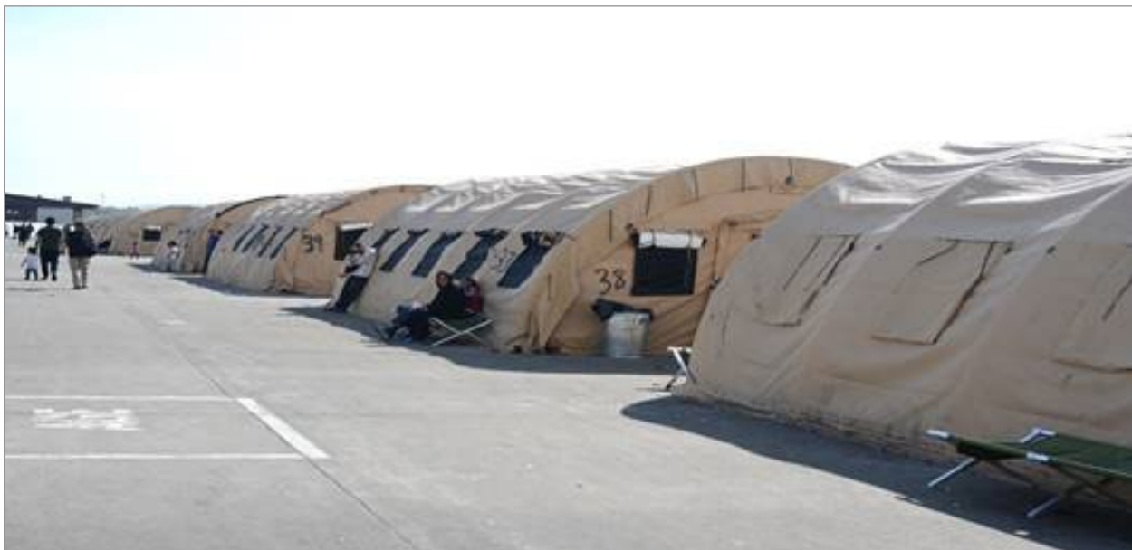
Figure 1. Tents used by evacuees at Ramstein Air Base

as a staging area during the evacuation) and $41.1 million in equipment. The DoD restoration reviewers approved $2.2 million for Ramstein AB for equipment and resupply of consumable items. A description of the damages from Air Force officials explained that the damage by guests was unrepairable. Air Force officials described tables, chairs, and cots broken by guests and tents and cots ruined by spray paint, human biological matter, and holes. The Air Force described materials as “completely depleted, such that no materials remain available for other real world missions.” In another example, Holloman AFB also experienced a reduction in its request related to medical equipment with a value of $18 million. The DoD restoration reviewers denied $84.1 million of the Air Force’s total request primarily because the Air Force began replacing damaged items before restoration directive was in place. Figure 1 shows the Ramstein AB tents when they were in use by Afghan evacuees during OAR and OAW.