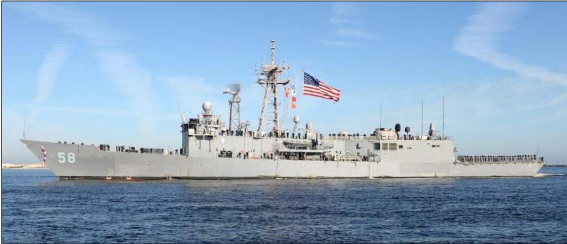
Figure 1. Oliver Hazard Perry (FFG-7) Class Frigate