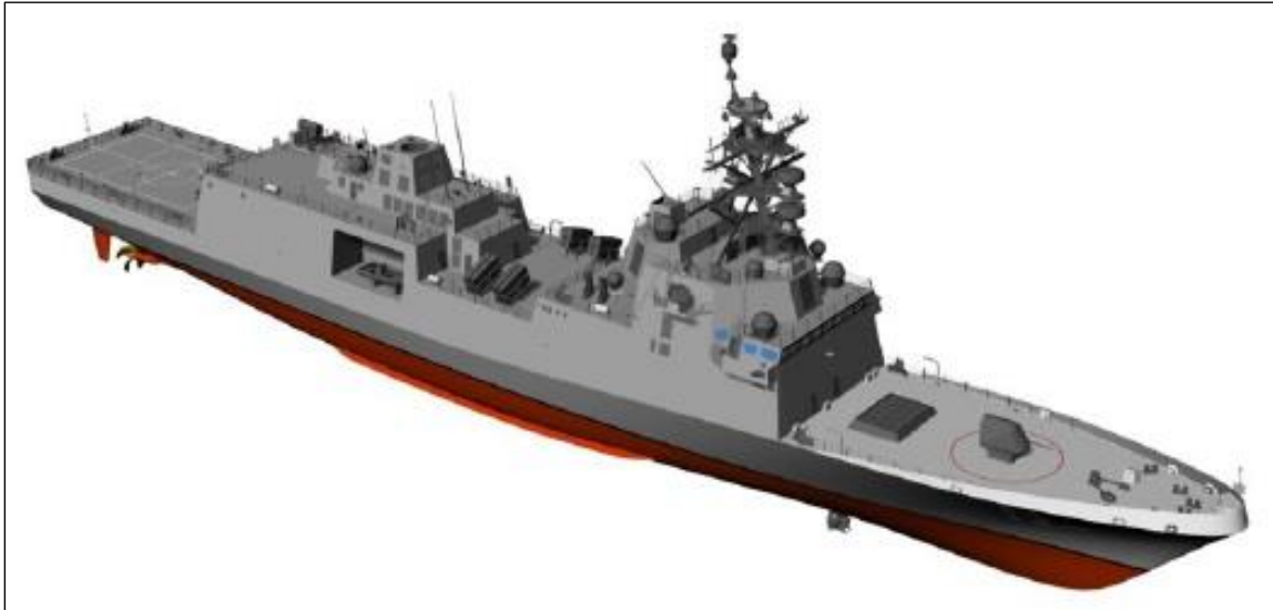
Figure 4. Constellation (FFG-62) Class Frigate Computer rendering of F/MM design