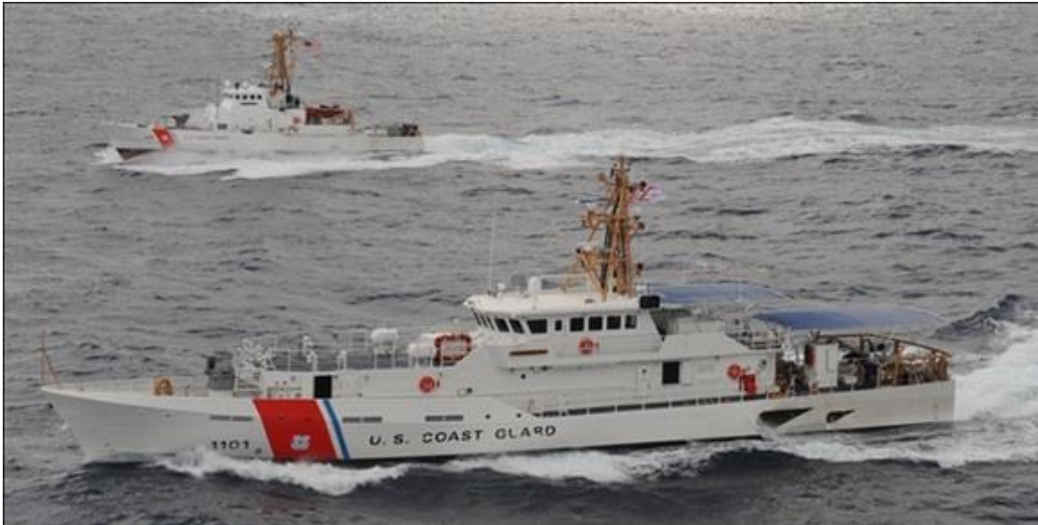
Figure 8. Fast Response Cutter With an older Island-class patrol boat behind