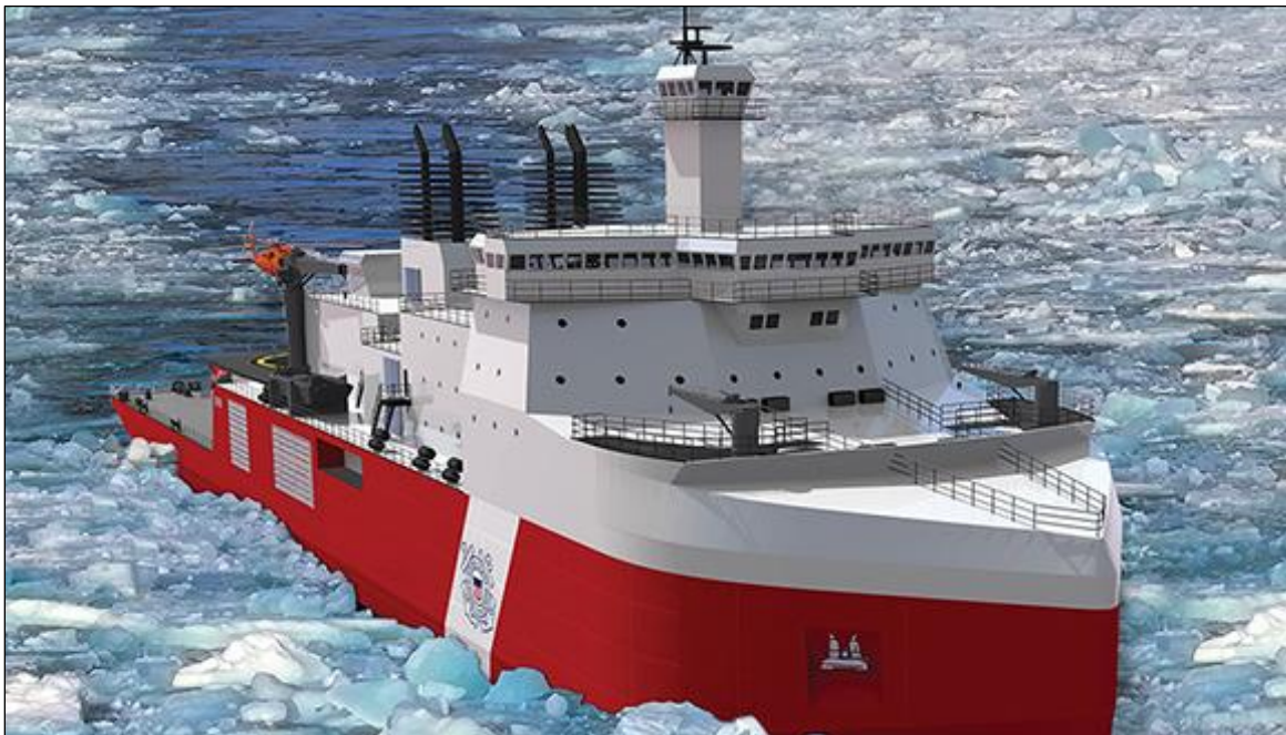
Figure 5. Rendering of Halter Marine Design for PSC