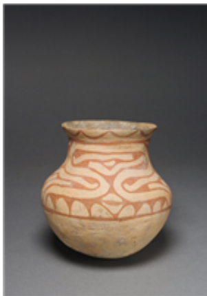
Vessel painted pottery 3600 BC-200 AD Thailand, Ban Chiang 8.5 inches x 8.25 inches