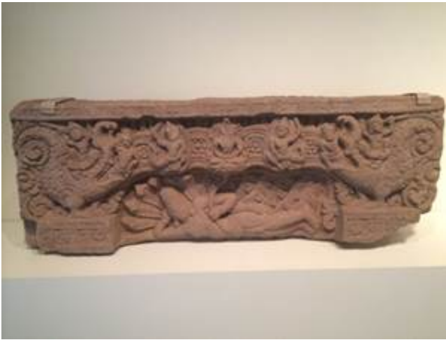
Sleep of Vishnu and Birth of Brahma (lintel) Tan sandstone Late 7th/early 8th century Cambodia, Khmer 52" x 18"