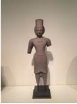
Standing Surya, Sun God Sandstone 7th-8th century, Pre-Angkor Period Cambodia, Khmer 25" x 9.5" x 4.5"