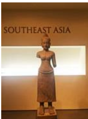
Standing Prajnaparamita Sandstone Ca. 1200, Angkor period Cambodia, Khmer H: 130 cm (51 1/5 inches)