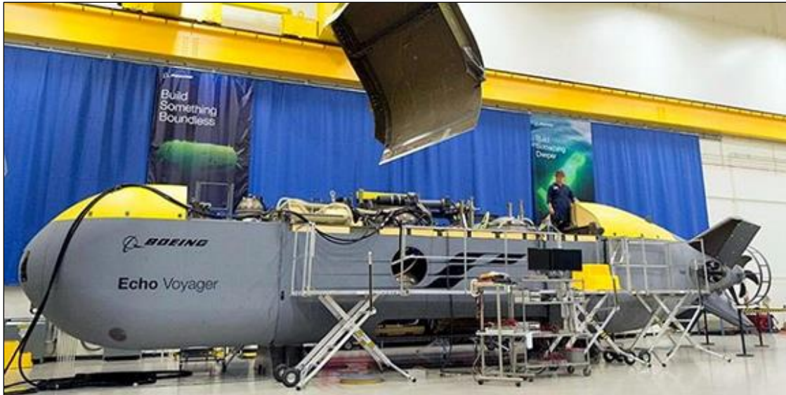
Figure 8. Boeing Echo Voyager UUV