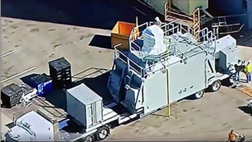
Figure 7. Reported SSL-TM Laser Being Transported