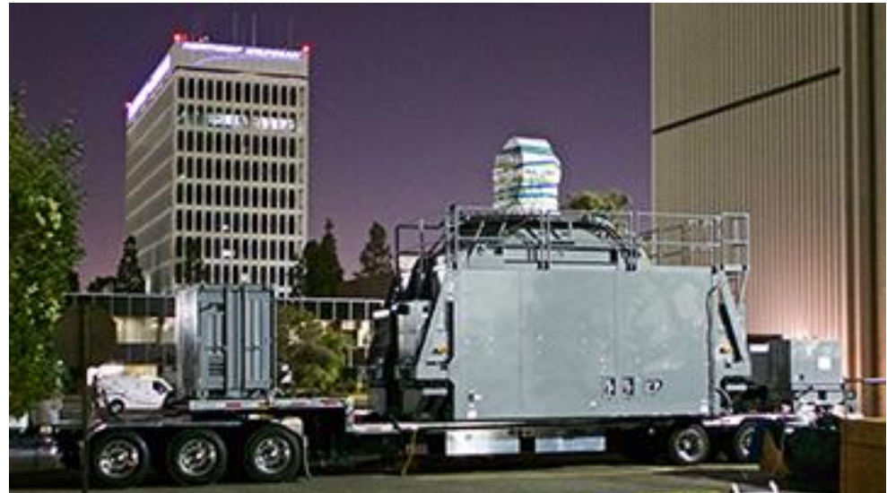
Figure 6. Reported SSL-TM Laser Being Transported