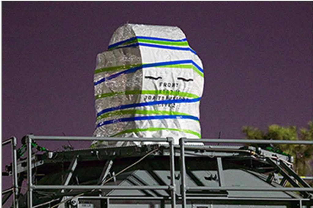
Figure 8. Reported SSL-TM Laser Being Transported