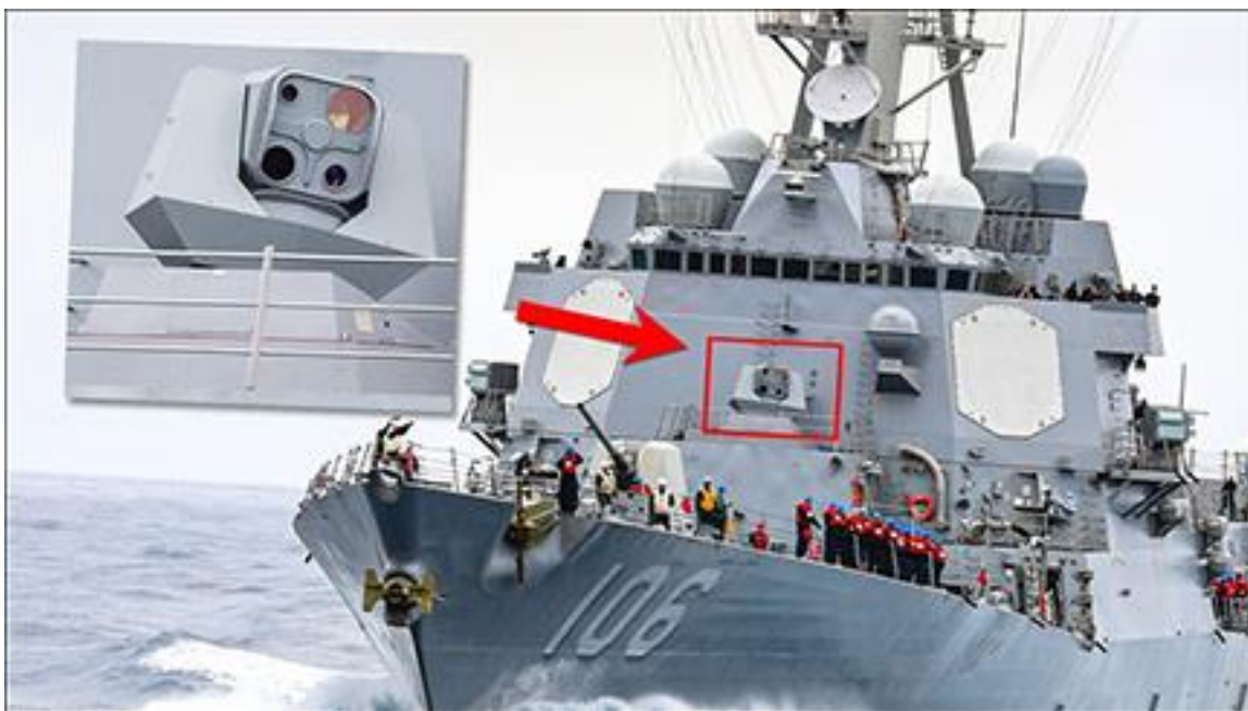
Figure 9. Reported ODIN System on USS Stockdale