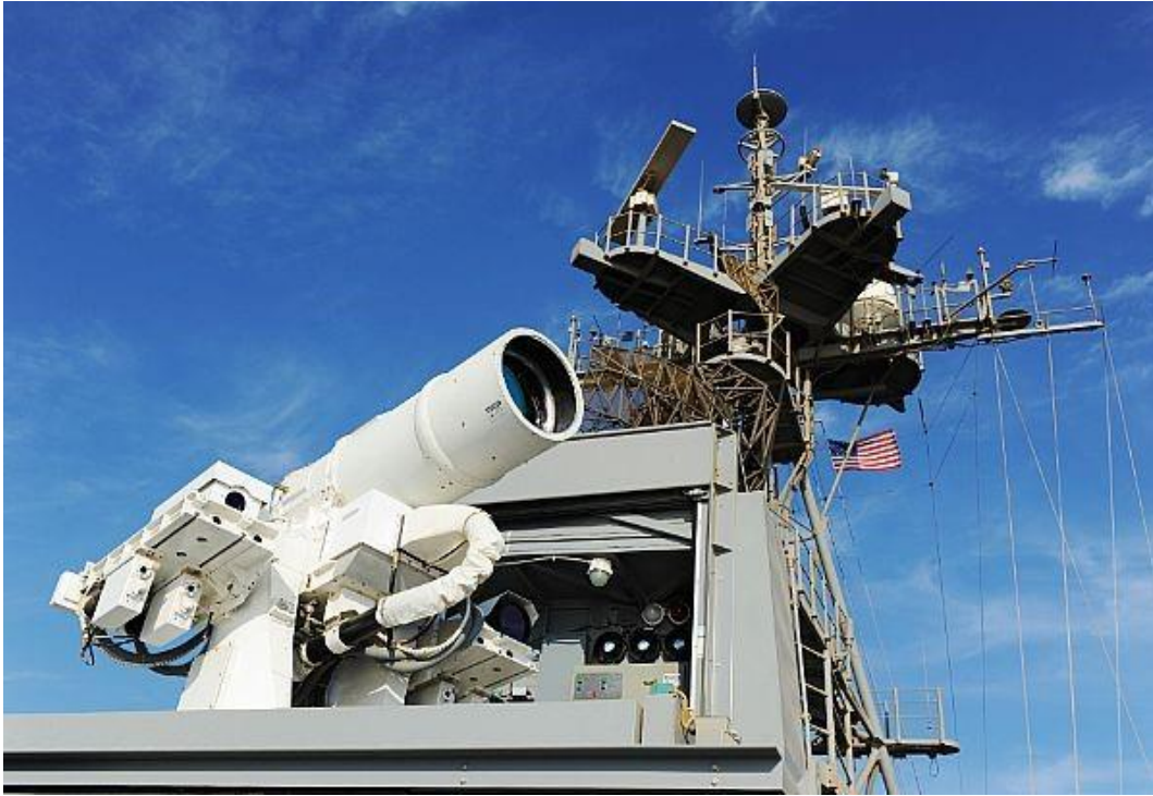
Figure 1. Laser Weapon System (LaWS) on USS Ponce