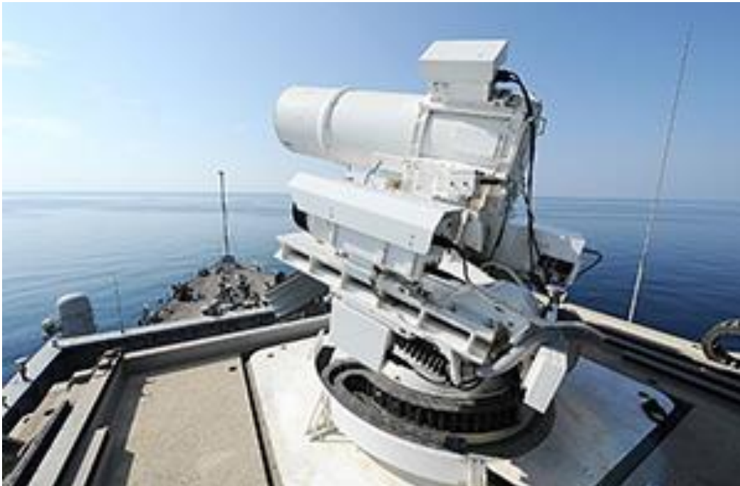
Figure 2. Laser Weapon System (LaWS) on USS Ponce