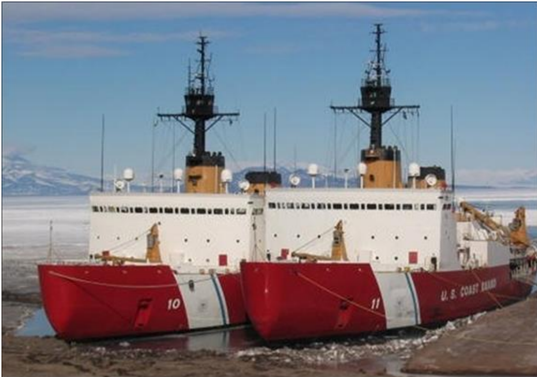
Figure A-1. Polar Star and Polar Sea (Side by side in McMurdo Sound, Antarctica)