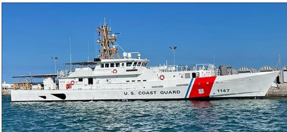
Figure 9. Fast Response Cutter