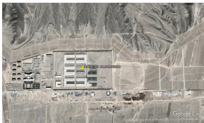
22 April 2018 (image available on Google Earth)