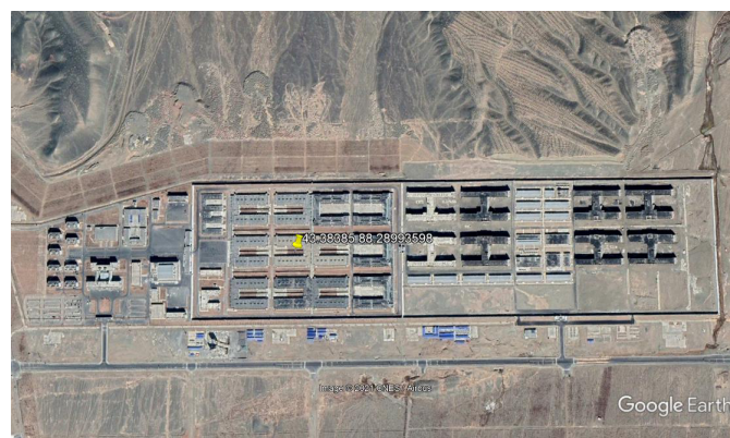
19 March 2020 (image available on Google Earth)

64. OHCHR examined a cross-sample of available judicial decisions in cases alleging terrorism or “extremism” with respect to defendants from ethnic communities in XUAR in the period 2014-2019. The number of publicly available and relevant court decisions is limited and may not necessarily be representative of the totality of judicial practice, but those that are available provide important insights into the way the judiciary has interpreted acts of religious “extremism”. 150 These include relatively minor infractions apparently punished severely; judgments referring to conduct being “extremist” despite none of the formal charges being related to terrorism or “extremism”; courts labelling acts as “extremist” without explaining how they fulfilled the applicable legal definition(s); the apparent targeting of underlying religious behaviour rather than the actual act for which the person is being prosecuted; and indications of an approach that considers any type of violation of law committed by a Muslim person as presumptively “extremist”.