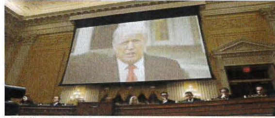
DONALD TRUMP ON A VIDEO SCREEN AS CASSIDY HUTCHINSON TESTIFIES ON TUESDAY

This article was first published on June 29 but taken down the next day after a legal threat from Lachlan Murdoch. We have decided to republish the article now, in order to clarify recent media reports about that legal threat.