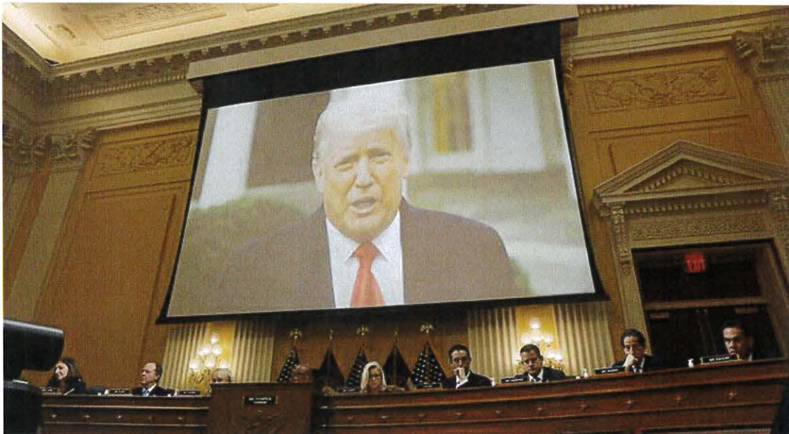
DONALD TRUMP ON A VIDEO SCREEN AS CASSIDY HUTCHINSON TESTIFIES ON TUESDAY

The House Select Committee to Investigate the January 6th Attack on the United States Capitol has already exposed extensive evidence of a plot by Donald Trump and his co-conspirators to overturn the 2020 presidential election result. But yesterday's