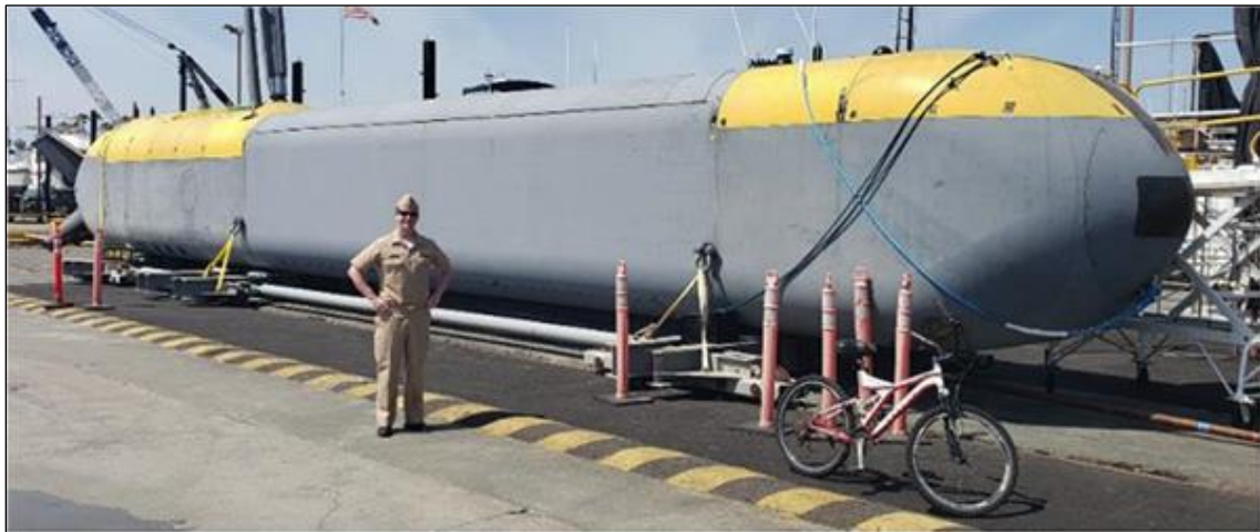
Figure 9. Boeing Echo Voyager UUV