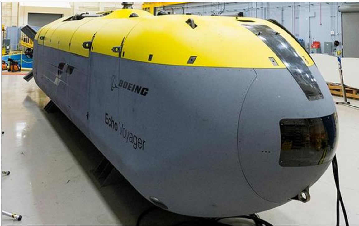
Figure 7. Boeing Echo Voyager UUV