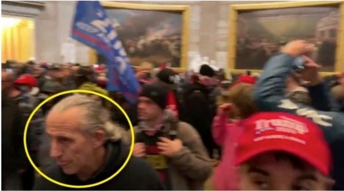
Timestamp approximately 8:06