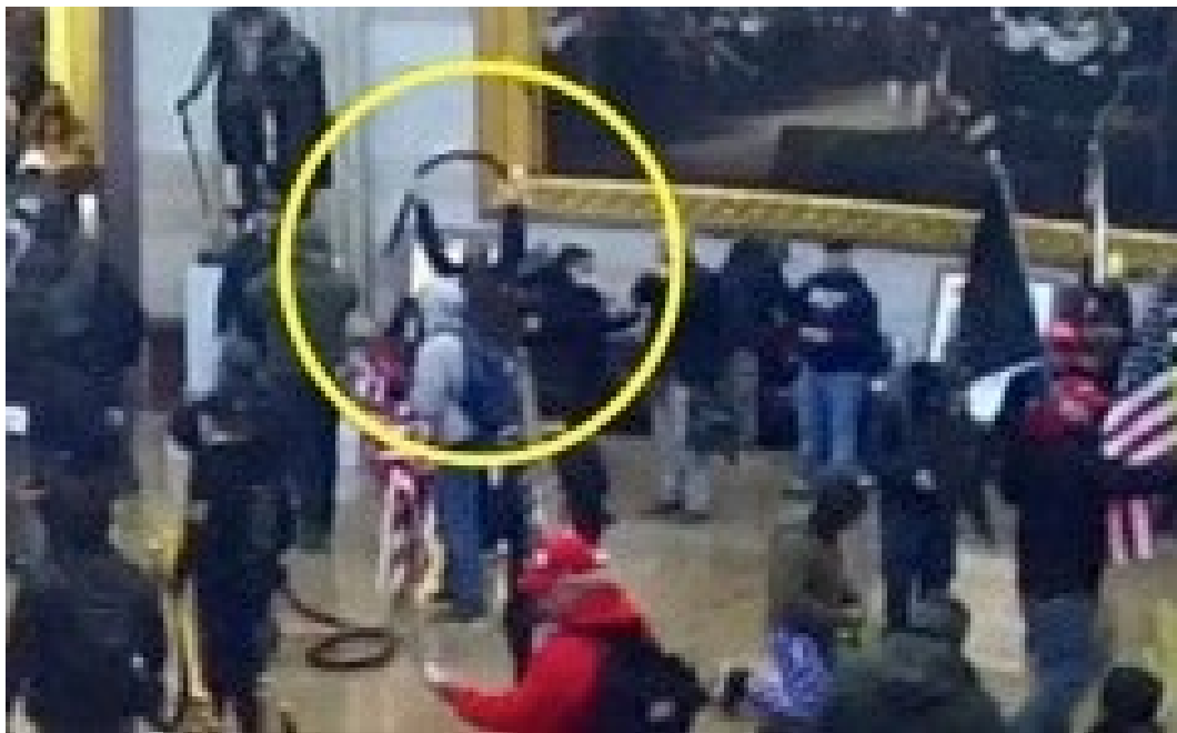
Timestamp approximately 19:43:29