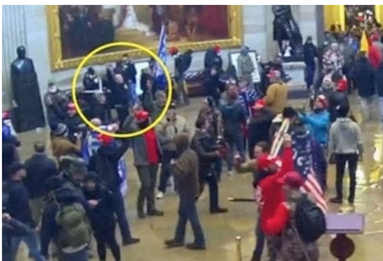
Timestamp approximately 19:41:17