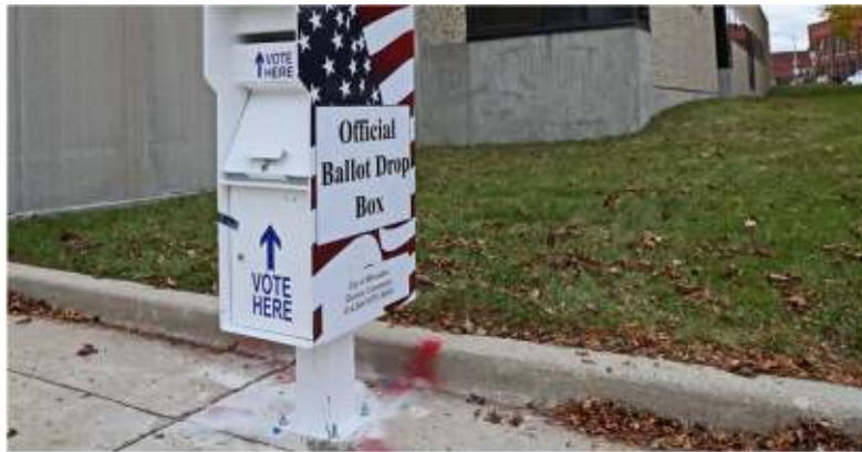
WEC administrator: Voters must place own ballots in the mail

longer permissible for any method of absentee voting, declaring at a press conference that “the voter is the one required to mail their ballot.” 1