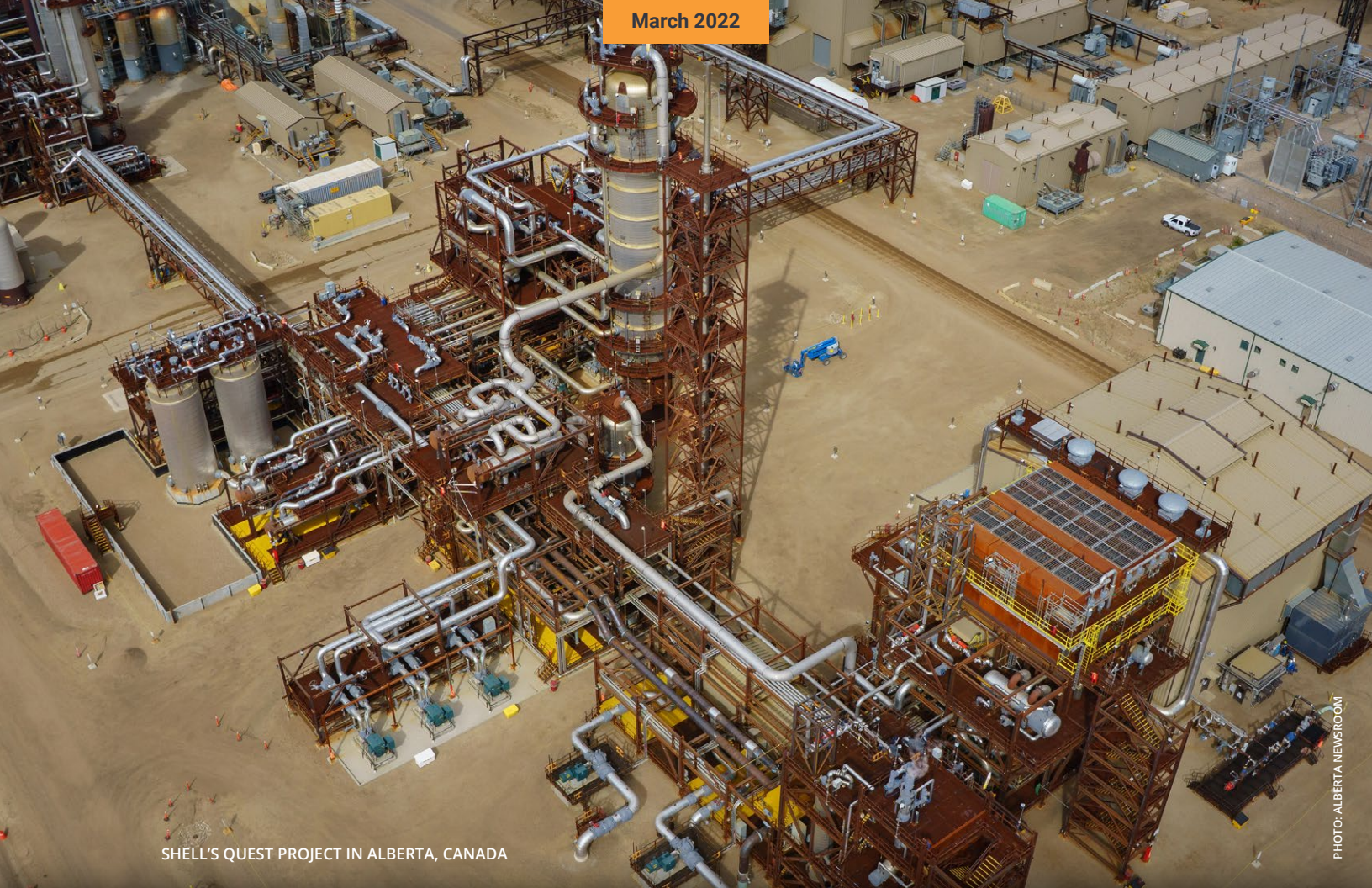
SHELL'S QUEST PROJECT IN ALBERTA, CANADA