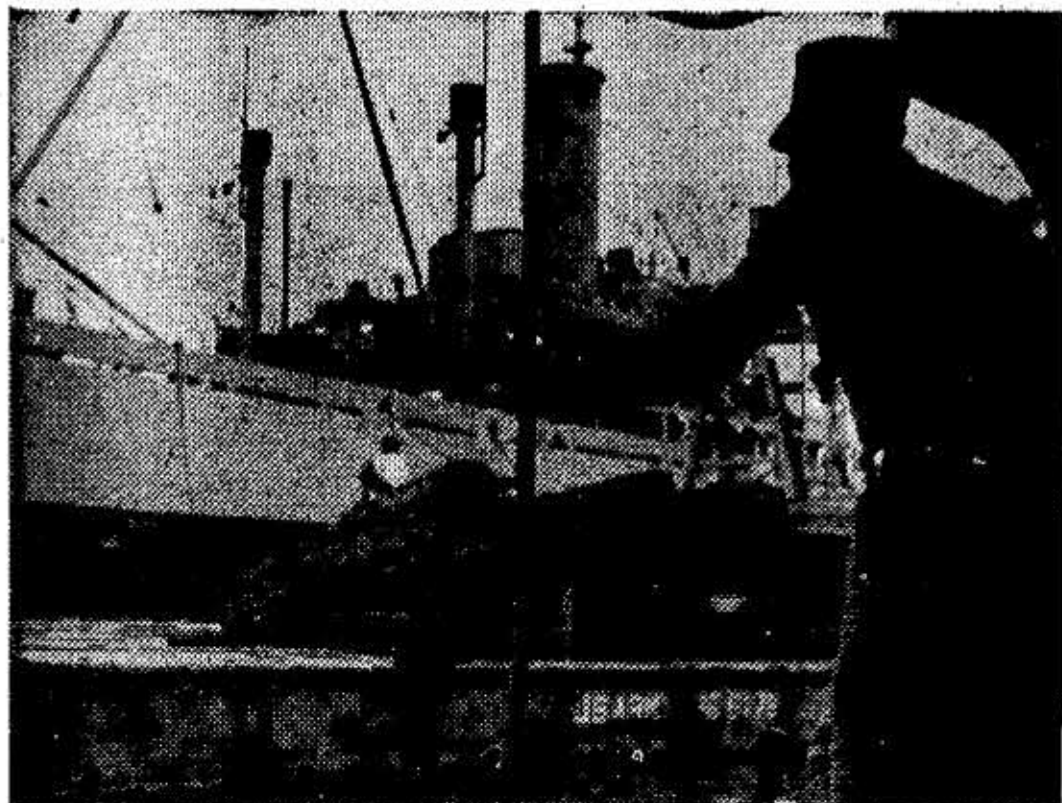
FREIGHTER unloading in the harbor (above) is checked by Army MP patrol, as are barges used to bring cargo ashore. Below, PFC Bobby Rutherford chats with Korean security guard.