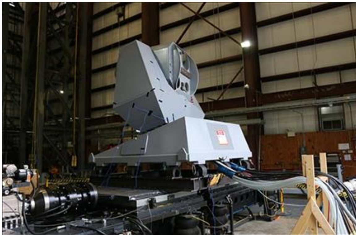
Figure 10. Reported ODIN System at Naval Support Facility Dahlgren

Source: Photograph accompanying Brett Tingley, “Here’s Our Best Look Yet At The Navy’s New Laser Dazzler System,” The Drive , July 13, 2021. The caption to the photo states that it shows “OSIN being tested at Naval Support Facility Dahlgren [VA] in 2020.” The article credits the photograph to the Navy.