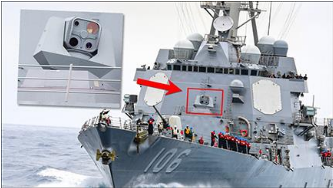
Figure 9. Reported ODIN System on USS Stockdale

Source: Photograph accompanying Brett Tingley, “Here’s Our Best Look Yet At The Navy’s New Laser Dazzler System,” The Drive , July 13, 2021. The photograph as printed in the blog post includes the enlarged inset and the red arrow. The article credits the photograph (and a similar second photograph used for the inset) to the Navy.