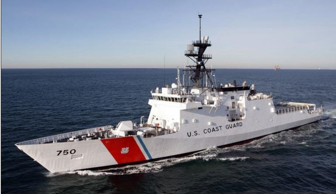
Figure 2. National Security Cutter

Source: Cropped version of photograph accompanying Huntington Ingalls Industries, “Bertholf (WMSL 750) Builder’s Trials,” March 22, 2019. The caption to the photograph states that it was taken on December 4, 2007.