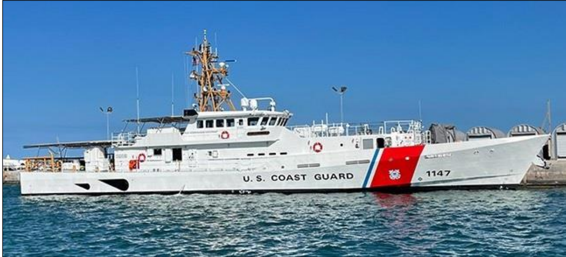
Figure 9. Fast Response Cutter