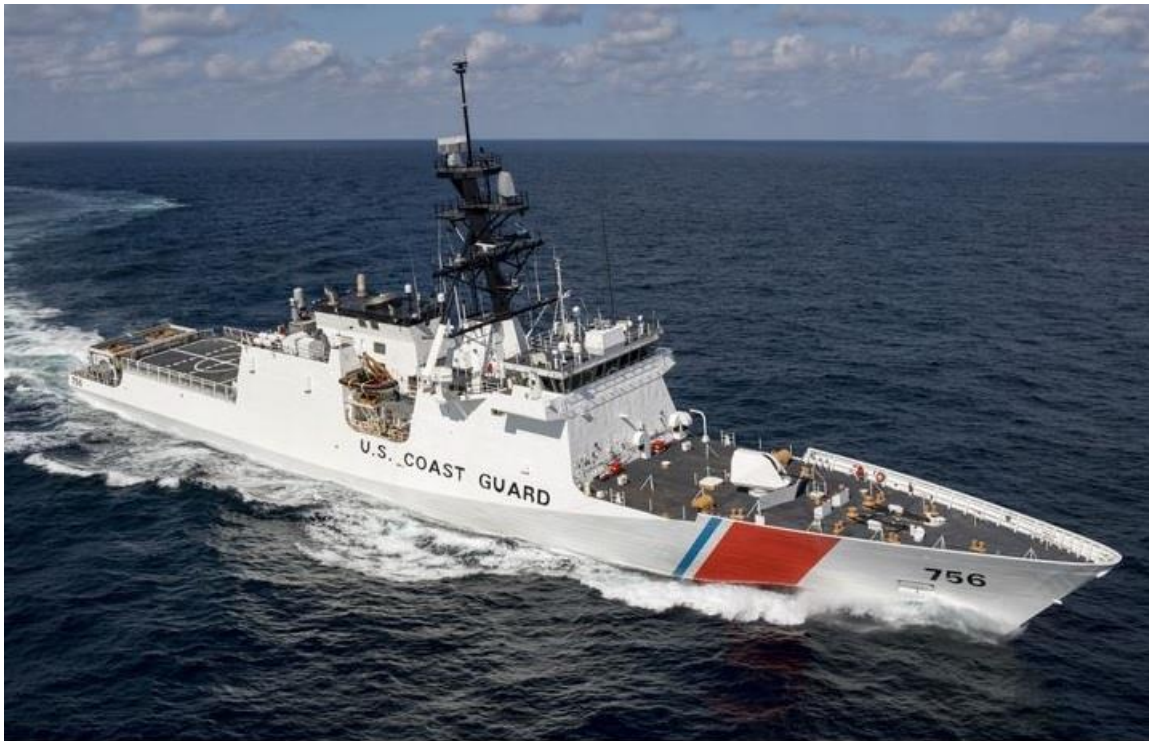
Figure 1. National Security Cutter